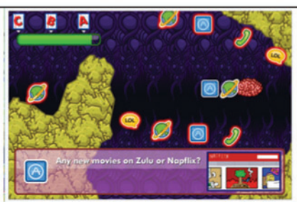
Lesson: Cell phones can distract you from focusing on important