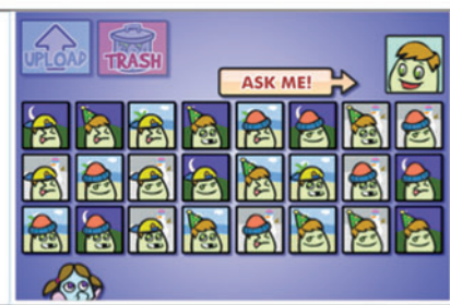
Lesson: Only post pictures online if you have permission from the people in the photo.

Objective: Identify the appropriate methods of communication.