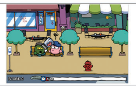
Lesson: Texting while in real-life conversations is rude. Don't "zone out" on your cell.