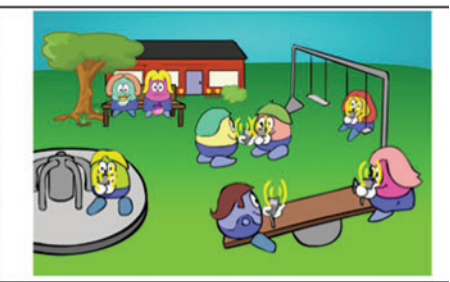
Lesson: Be careful what you choose to share as posting things online can never be taken back.

Objective: Post information that you'd be happy for anyone to see.