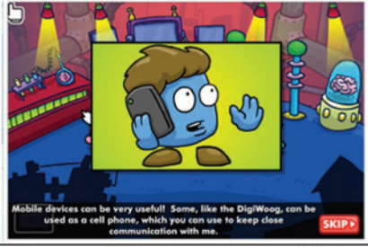
Lesson: Cell phones are useful for more than just games.