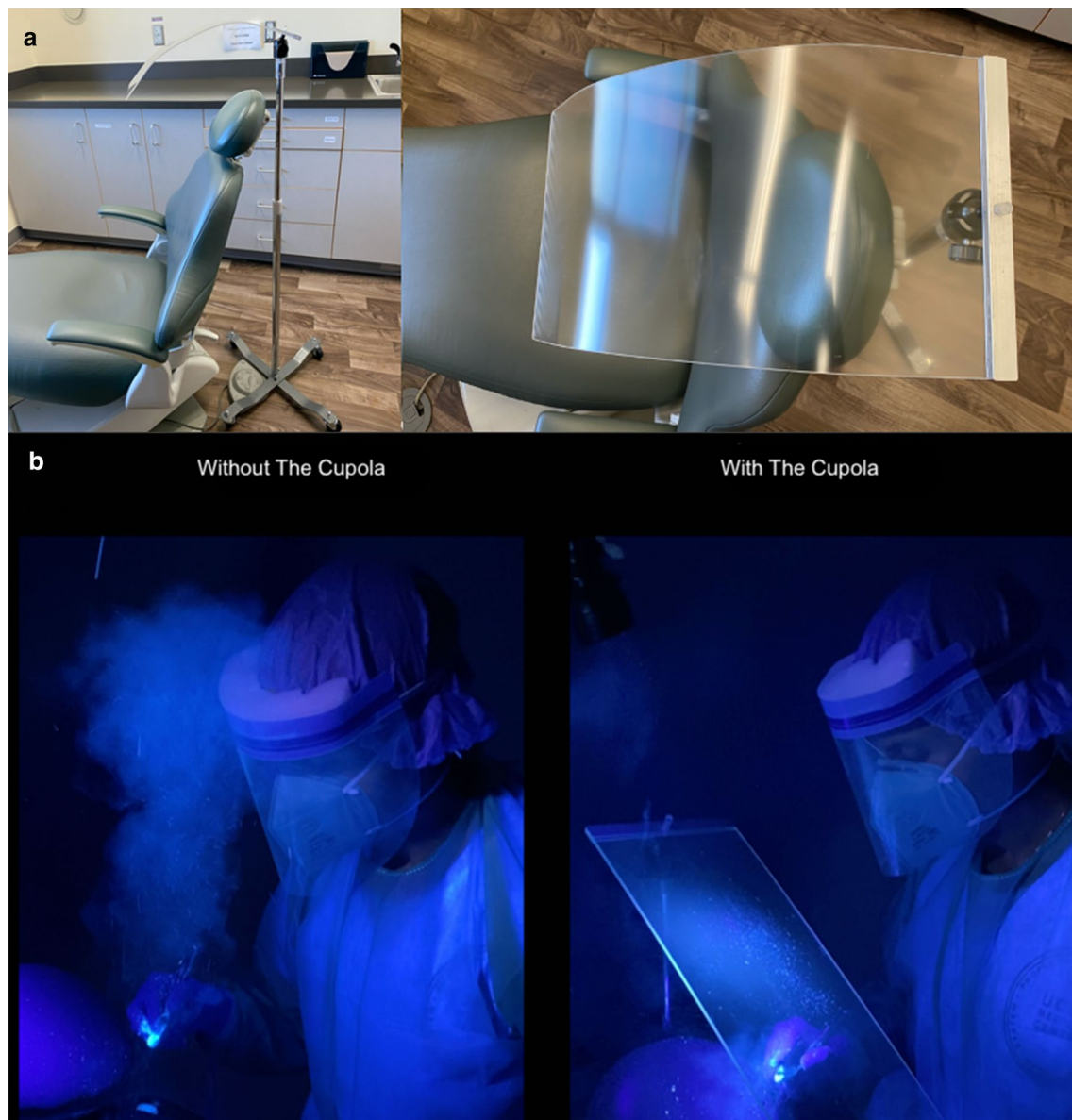
Fig. 1 a The Cupola—protective shield. b Simulated dental procedure using a high-speed handpiece without and with The Cupola

We hypothesized that the use of The Cupola during aerosol generating procedures in the oropharyngeal region decreases the spread of droplets and aerosols in dental offices, which could lead to safer dental practices. This has potential implications to decrease the spread of disease among dentists, maxillofacial surgeons, otolaryngologists and their patients. The aim of this pilot study is to assess the efficacy of The Cupola in decreasing the spread of droplets and aerosols during simulated aerosol generating dental procedures.