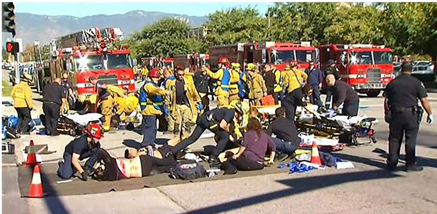
Figure 2. Casualty collection point.

conduit to both EMS and fire assets as well as providing operational input to the incident commander.