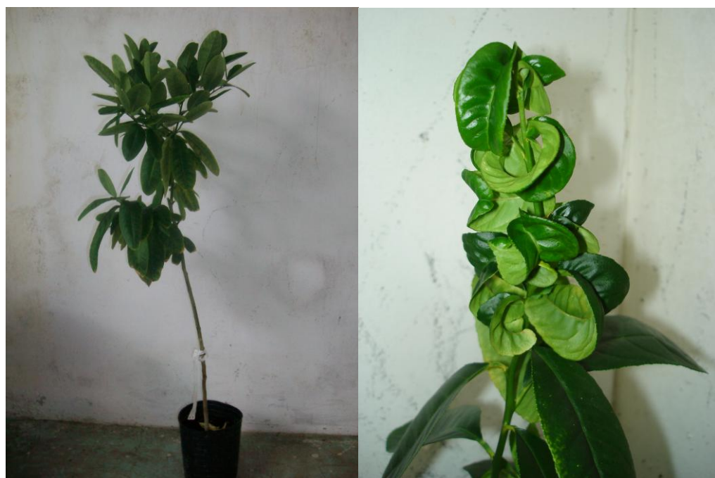
Fig 1. Etrog citron grafted on rough lemon – Left: negative control (non inoculated) and Right: positive control with exocortis symptoms.