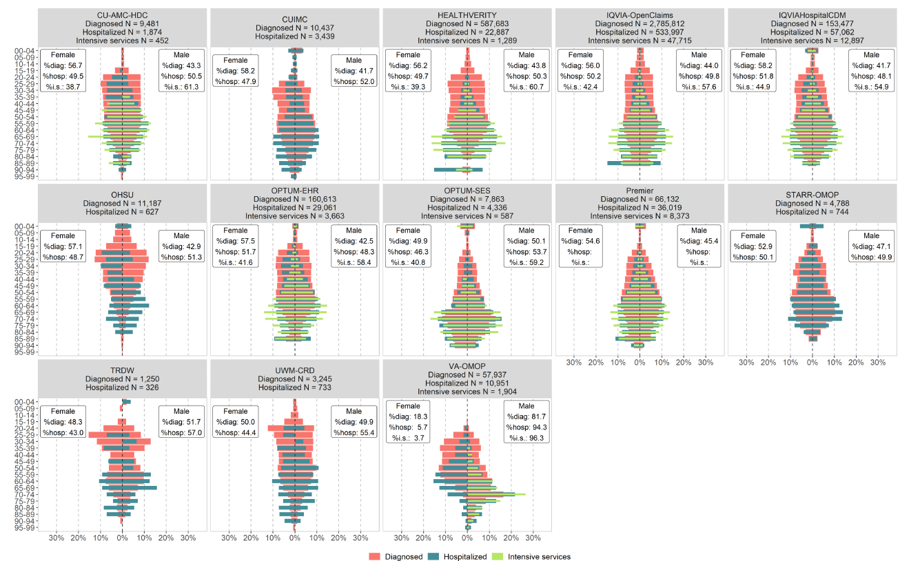
Figure 2 Distribution of diagnosed, hospitalized and requiring intensive services COVID-19 cases by age and sex across the OHSDI COVID-19 network in the United States.

In the USA, the proportion of diagnosed cases generally decreased with age, with most diagnosed cases being within the 25 to 60 age group. The proportion of cases hospitalized and intensive services increased with age, with the highest proportions of cases of hospitalized, or intensive cases in the 60 to 80 year age group (Figure 2). A slightly higher proportion of women were diagnosed than men but a greater proportion of men were hospitalized (and where available, required intensive services) than women in the USA databases. In Europe, databases captured diagnosed or hospitalized cohorts but had limited information on intensive services. In Europe, databases capturing hospitalized cases (HMAR, HM-Hospitales, SIDIAP, and SIDIAP-H) showed a similar trend to the USA databases in that there was a higher proportion of men were hospitalized than women (Supplementary Figure 1). Unlike the USA and European databases, there was also a higher proportion of women in hospitalized cases in the South Korean database (HIRA). Age-wise trends in the European and Asian databases were similar to those in the USA databases, in that the bulk of the diagnosed cases