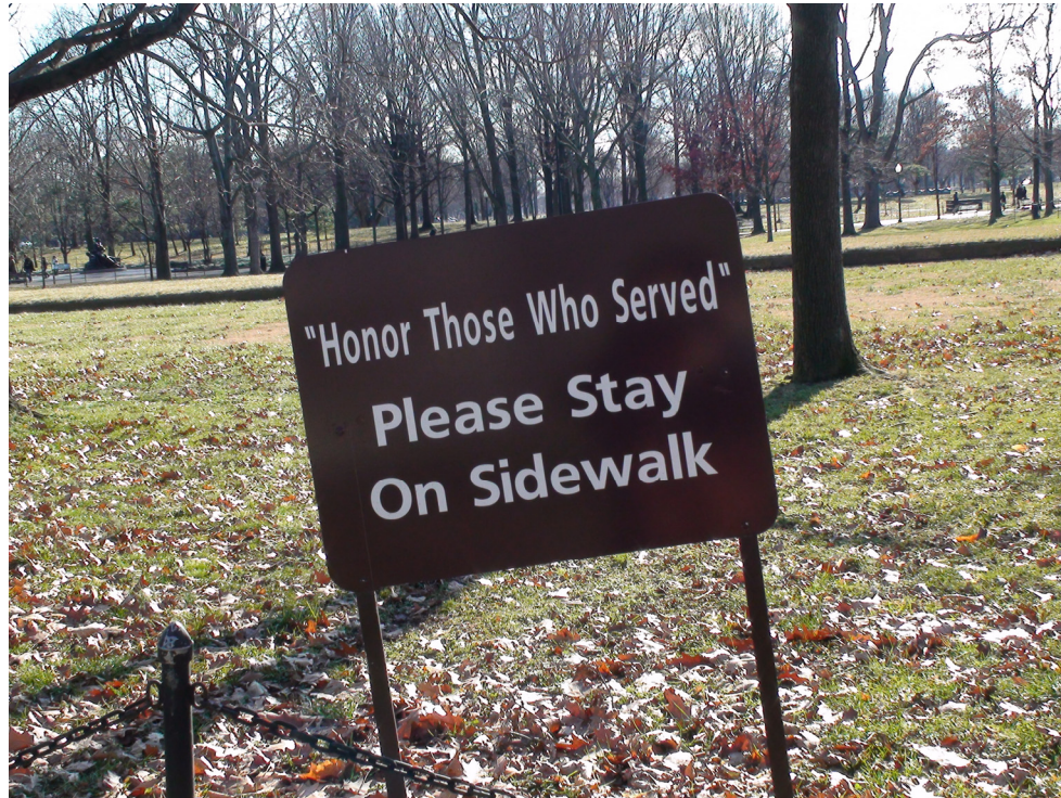
Figure 8. “Honor Those Who Served” Sign, Vietnam Veterans Memorial. 203

The strategic insertion of signifiers of containment like the series of chains and stanchions guarding landscaped portions of the site from human trespassing, funnels incoming visitors along a specific trajectory within the site. This, coupled with the presence of wooden signs situated along the borders of the VVM stipulating spatial non-access, shrink the possibilities of spatial practices and resistances available to VVM visitors as the body is bounded a specific walking trajectory.