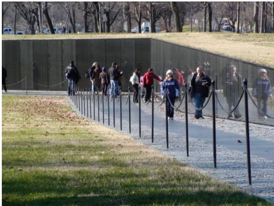
Figure 15. Vietnam Veterans Memorial. 369

accompanied by the names of soldiers who perished during that time. The shifting, moving quality of the wall is buttressed by the allusions to a forward moving scope of time also inscribed on the granite panels and accompanying the reality of the war. But it is the seemingly constant stream of names that also propels the visitor-user-dancer forward as he/she is drawn by the names vaguely taking form in the distance, etched on the faces of panels further ahead. The body wants to move forward to see better these names not yet fully discernable. As such the memorial wall, as a “moving composition,” instigates the body’s movements. 368 And such forces of motion cannot be divorced from the gravity of death and loss, as the multitude of names that pushes bodies to motion helps construct a choreography, specifically a walk of mourning.