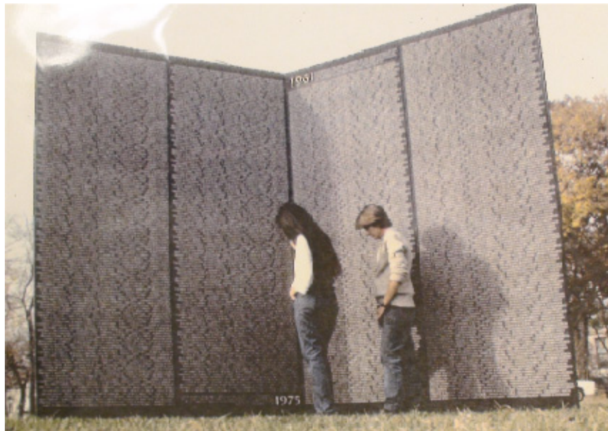
Figure 14. Maya Lin in front of full-scale wall panel. 303

panels. These two mock panels represent the memorial's apex. Lin's presence in the memorial archives is most obvious in these images, which capture not only her body in relation to her design, but also capture her participation in the production of the memorial site. In these images, her back is turned towards the mock-up with her hands stuffed in her pockets as her shoulders are hunched and head bowed toward the panels.