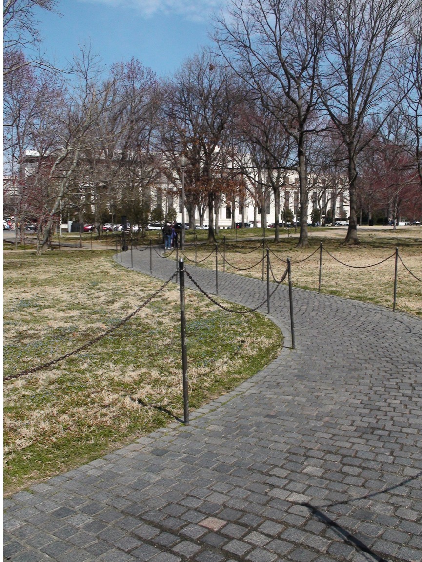
Figure 7. Path Leading Out From East Exit Towards Washington Monument. 202