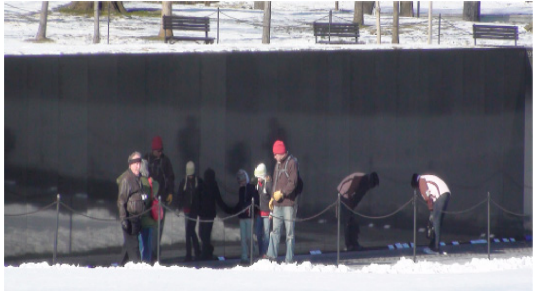
Figure 16. Practices of Solitary and Group Memorialization. 373