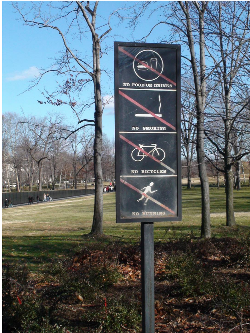
Figure 10. Impermissible Actions, Vietnam Veterans Memorial. 206

Upon stepping onto the walkway leading towards the first panels of the memorial wall, I noticed signs prohibiting food, smoking, bicycles, and running. A ban on these actions carries direct implications for the body. As such my own body tensed, my muscles already turning vigilant toward the potential cropping up of gestures veering towards the possibility of excessive force equated with any of the impermissible