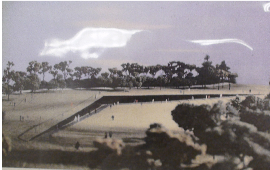
Figure 4. Aerial View of Model of Vietnam Veterans Memorial. 199