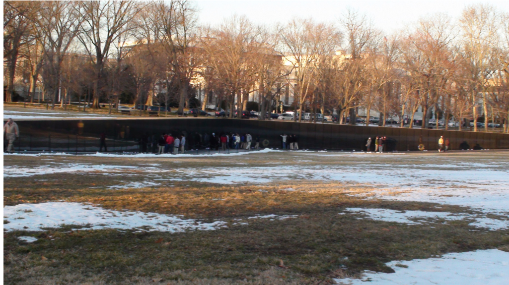
Figure 1. Vietnam Veterans Memorial. 148

Opposition to the VVMF's design selection is not unrelated to the definition of memorial embedded in our national psyche. The memorial is more than just a structure erected for commemoration, it is also a structure that generally works to represent and commemorate in literal, patriotic form. By positioning the archive as a form of commemoration, and later in this project, by arguing for seeing the body in the memorial as inhabiting the role of ephemeral, moving memorial, I am arguing for a more imaginative and looser construction of memorial. I want to propose a conception of memorial that retains its linkage to a practice of remembering/commemorating that is vulnerable to and subject to effacement. And moreover, I propose a notion of memorial that is not always confined to the idea of architecture or permanence.