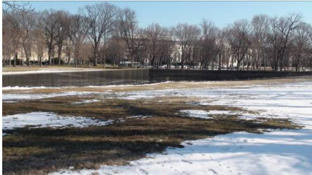
Figure 18. Empty Memorial. 433

less magnetic, less moving.” 432 Authors also suggest the memorial is only complete, its meaning only fully accessible with the presence of bodies.