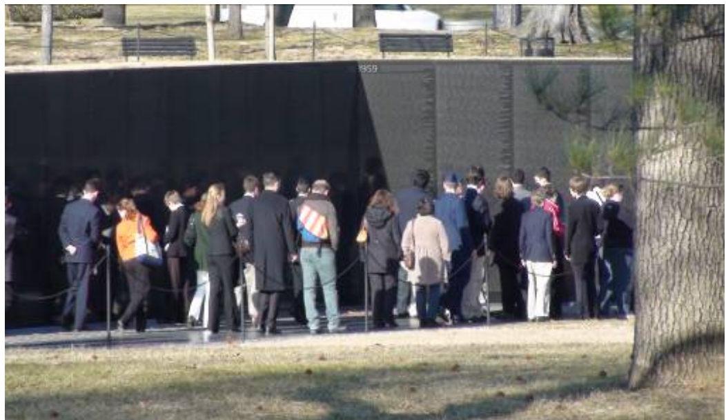
Figure 17. Collection of Bodies at the Apex. 374