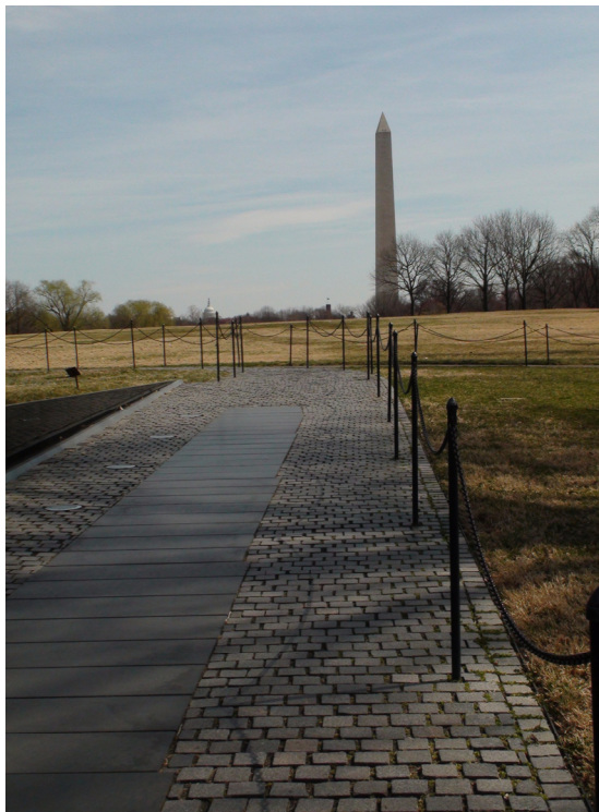
Figure 6. East Entrance/Exit, Vietnam Veterans Memorial. 201

The stewardship of the VVM was transferred to the National Park Service after Constitution Gardens was developed into the Vietnam Veterans Memorial. As this governing institution presided over the upkeep and maintenance of the VVM, the NPS also inserted additional elements to the site. While the integrity of the memorial wall, The Three Serviceman statue, and the American flag remain in tact, the presence of additional elements to the VVM works to undermine the initial concept sanctioning the fluidity of human trajectories that would contribute to the variability in the rhetorical content of the memorial (site).