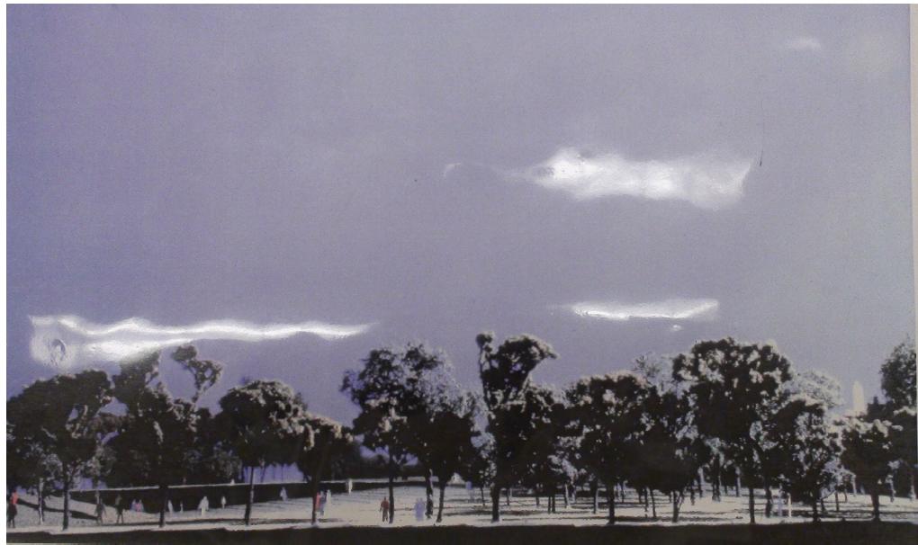
Figure 3. Eye Level View of Model of Vietnam Veterans Memorial. 198

Maya Lin viewed the landscape as a central component to translating the intention of architecture. This is evidenced in photographs capturing a model of her proposed architectural design, which reveal paper figures occupying the full extent of the memorial landscape rather than being contained, as they are now, within the vicinity of the architectural elements. 197