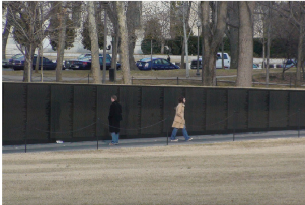
Figure 12. Vietnam Veterans Memorial Wall. 289

pauses: stepstepstepstep. However, they abruptly stop at the fourth panel of the west wall. The twosome separate, each taking time to walk away from the other, locating a sphere of privacy as they stand feet apart of each other.