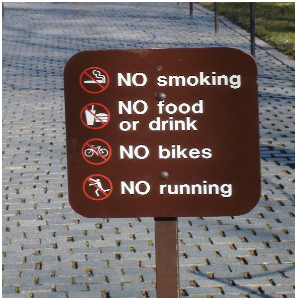
Figure 9. Impermissible Actions, Vietnam Veterans Memorial 205

If the open grid (of a city) within which the body can compose such “migrational” metaphors is reduced to a single pathway, wherein visitors are ushered into and out of the memorial site by seemingly unending sets of chain and stanchions reinforced by signs conflating patriotism with avoiding the grassed areas of the memorial site, then what is the status of bodily action? 204 Not only are we restricted from large portions of the VVM, as the carefully landscape areas are distinctly absent of human occupation and activity, but our choreographic arsenal is also monitored by placards posted at the memorial’s entrance/exits. The (hegemonic) spatial system of the VVM is indeed narrowed by under the direction of the NPS.