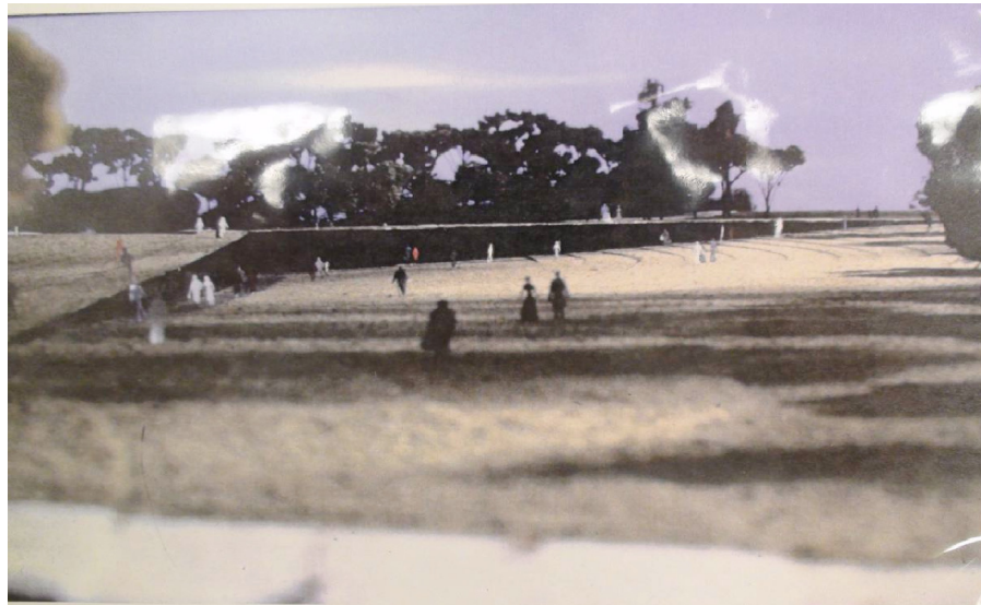
Figure 5. Ground Level View of Model of Vietnam Veterans Memorial. 200