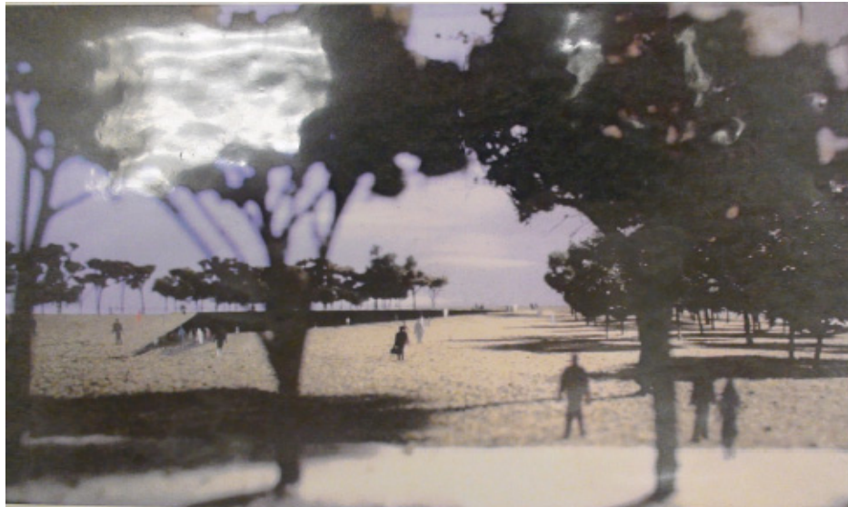
Figure 11. Eye-Level View of Model of Vietnam Veterans Memorial. 276

Lin's memorial in miniature proposes a stream of visitor movement disallowed in actual memorial space. She has scattered cardboard figures across the memorial site to suggest unrestricted travel and interaction with the entire site. Cardboard figures are situated along the black granite pathway running parallel to the black granite walls and positioned in the landscaped areas circumscribing the memorial structure itself.