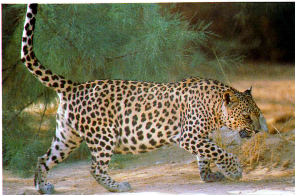
Fig. 3 - Adult female of Arabian leopard, Panthera pardus nimr Hemprich and Ehrenberg, 1833.