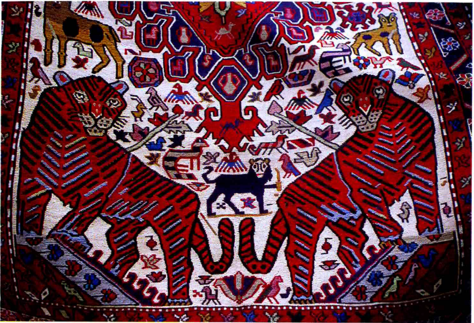
Fig. 1 - Traditional Eastern Anatolian kilim showing, among other animals, the images of tigers and lions.

(Schreber, 1776), Lynx lynx (L., 1758), and possibly Panthera pardus (L., 1758), is still reported from several Anatolian areas, although human persecution had largely confined them to isolated areas. The present paper deals with the recent historical diffusion of these species in Anatolia. It is based on a review of previous knowledge of the Turkish wild cats and their history, on contacts with the Forest Department of Antalya, the Samsundag National Park (Izmir), and the Termessos National Park (Antalya), as well as on original data. Museum specimens were examined in the Natural History Museum, London (BMNH), the Termessos National Park Museum, Antalya (TNPM), the Natural History Museum of the Aegean, Samos (NHMA), the Zoological Museum of Tel Aviv University (ZMTU), and some Near-Eastern private collections.