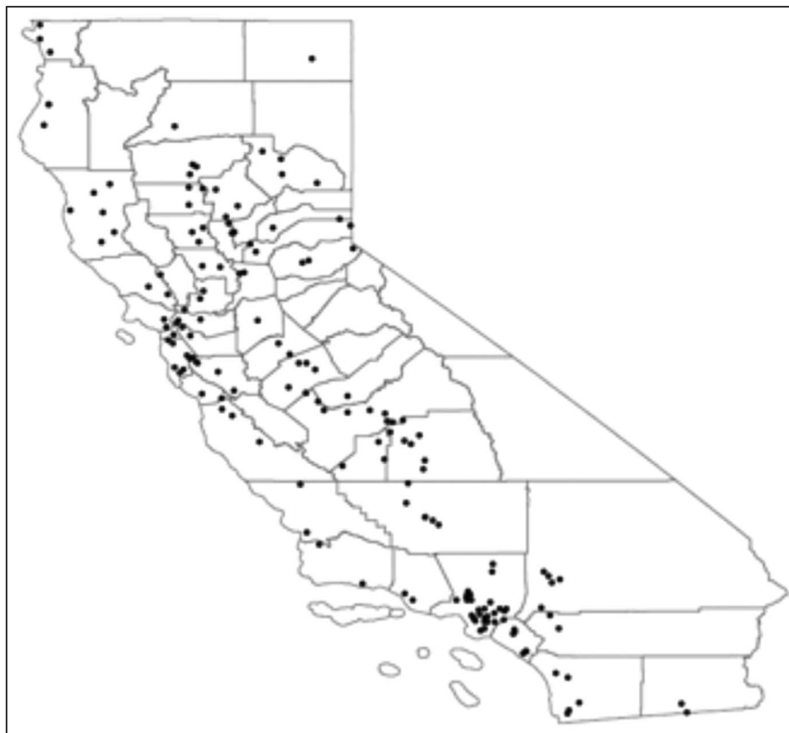
Fig. 1 Locations in which stores included in the CX 3 (Communities of Excellence in Nutrition, Physical Activity, and Obesity Prevention) sample are situated; cross-sectional statewide survey in low-income neighborhoods in California, 2011–2015

In the sampled stores, the average recorded lowest prices for fruits and vegetables were lowest in large grocery stores for four of the items recorded (apples, bananas, carrots, broccoli) and lowest in small markets for three (oranges, tomatoes, cabbage; Table 3). Convenience store