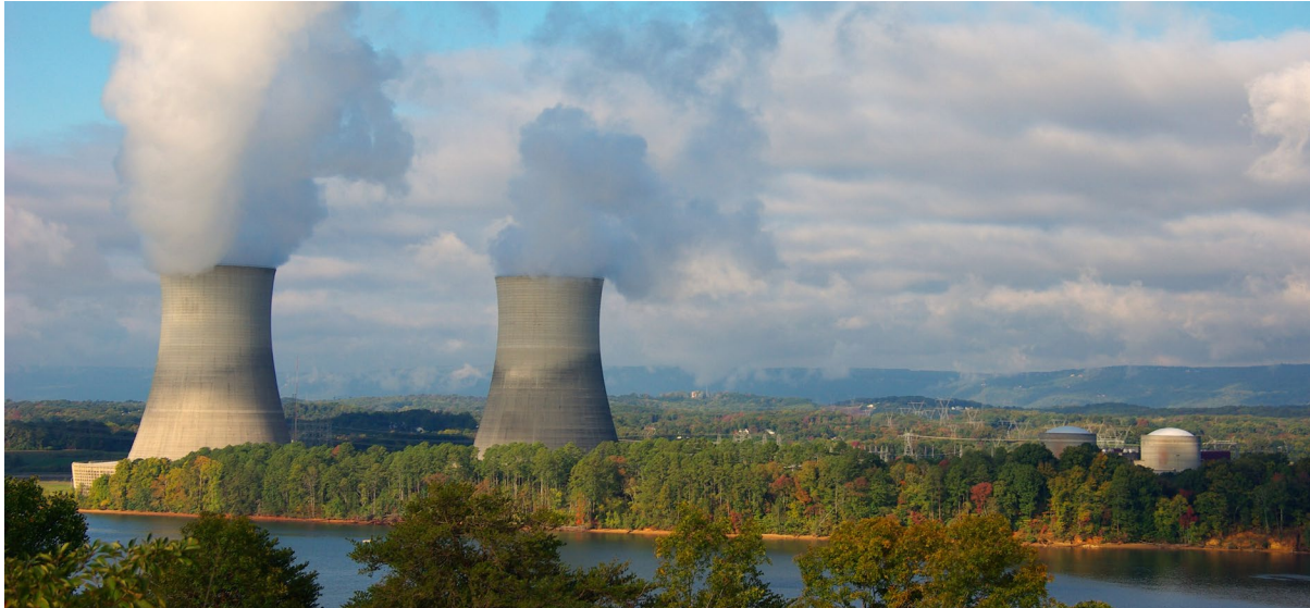
Sequoyah nuclear power plant near Chattanooga, Tennessee.