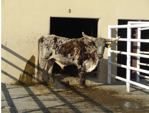
Fig. 1. A 5-year-old mixed breed bull showing clinical signs of paratuberculosis, including thin body condition and profuse diarrhea.