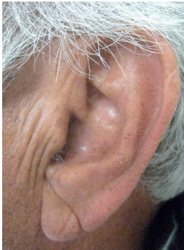
Fig. 1. A 69 year old man with a very well defined diagonal ear lobe crease on the left side.

Frank’s report was quickly followed in 1974 by the publication of the first controlled clinical study in which DELC (unilateral or bilateral) was shown to be significantly more common (47%) among all age groups of patients (N=531) hospitalized in a USA coronary-care