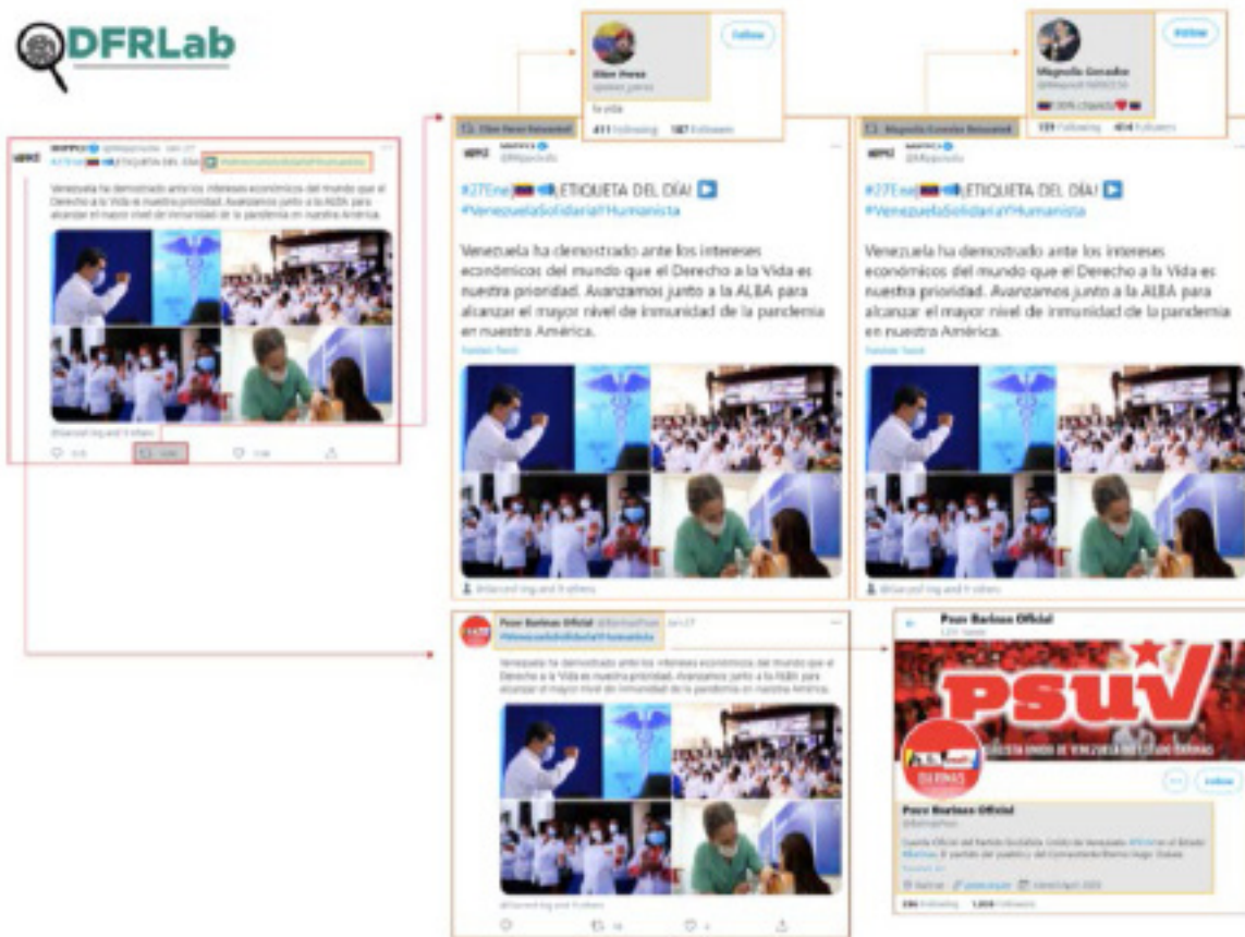
The flow of a single "etiqueta del día," with the MPPCI account introducing it (left), two accounts—both of which exhibit suspicious behavior, such as anonymity, extremely high posting rates, and ratio of retweets to original tweets—retweeting it (top middle and right), and a PSUV-affiliated account reusing it (bottom). 58