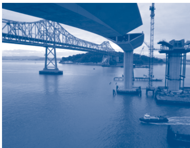
New east span under construction beside the old east span

The debate soon reduced to finger-pointing: state officials accused Bay Area lawmakers of placing aesthetic concerns over safety, while Bay Area lawmakers accused state officials of placing financial concerns over safety and throwing in an ugly bridge as part of the bargain. In July 2005, the parties compromised: the state provided some extra money, but also turned control of the project over to the MTC, which would pay for the remainder (including any future cost overruns) by floating bonds and increasing tolls on Bay Area bridges. In February 2006, the suspension span contract went out to bid again.