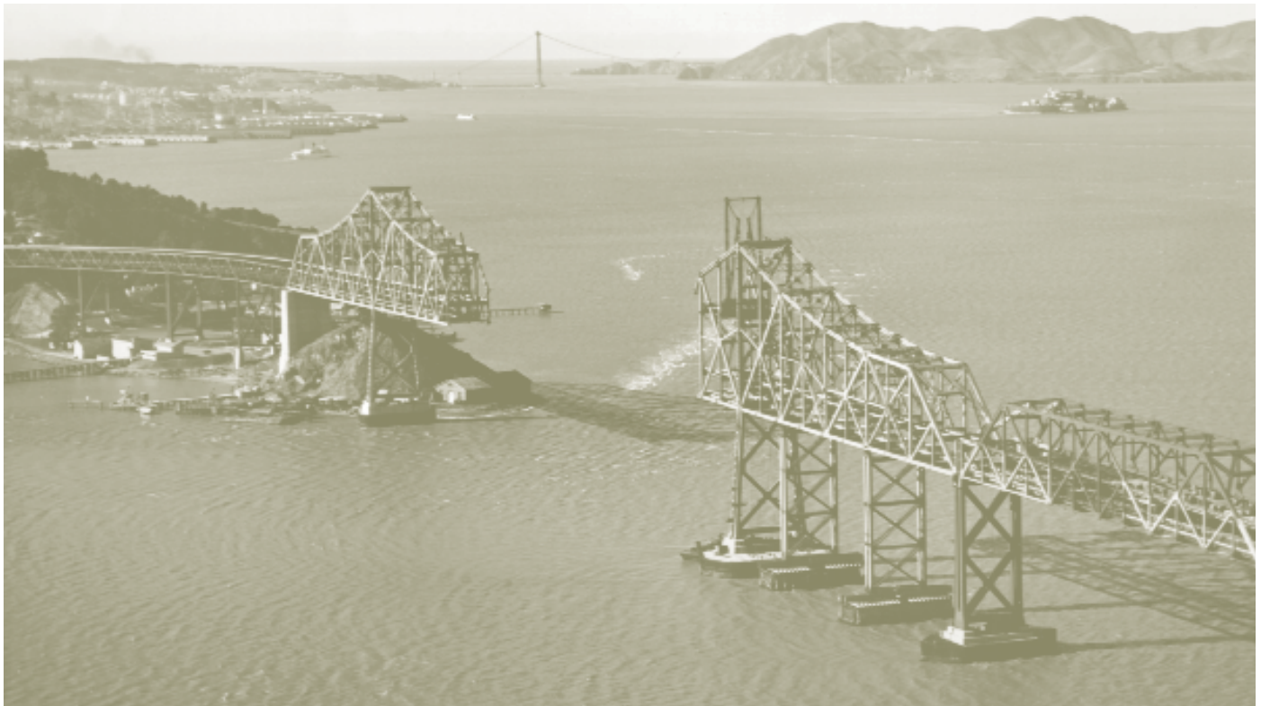
San Francisco-Oakland Bay Bridge original east span and Golden Gate Bridge (background) both during construction