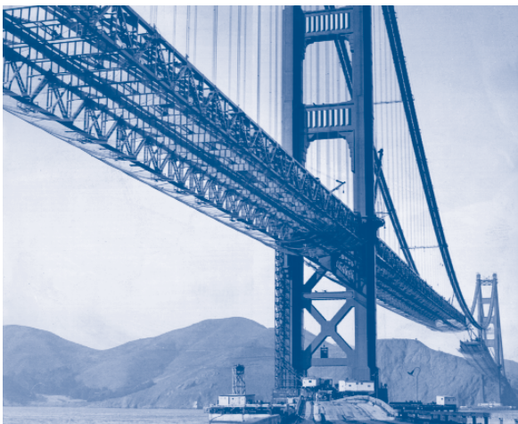
Construction of the Golden Gate Bridge

From the beginning, the Bay Bridge project was significantly more ambitious than the Golden Gate Bridge. When completed, it was the longest, heaviest, deepest, and most expensive bridge ever built. It was considered an essential transportation link in the state economy, and as an official state project (unlike the self-financed Golden Gate) had little difficulty gaining funding. But pure functionality did not completely rule the day: the Bay Bridge's original design, a matched set of cantilevered