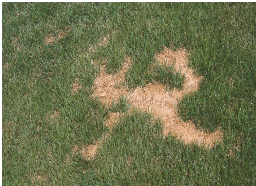
Figure 2. Grass “burned” by spill of lawn fertilizer.

expensive than soluble fertilizers per pound of actual nitrogen content. Some of these natural materials may contain weed seeds or salts, and some may have unpleasant odors. Their advantage is that they release nutrients over an extended period of time.