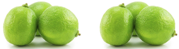
Figure 1: An example of a visual scene with multiple groups of similar objects.

During production of quantified descriptions, pragmatic constraints are often in tension with perceptual constraints. For example, when placed under time constraints that make exact enumeration difficult, people produce inexact quantified descriptions of sets of items (Briggs, Wasylyshyn, & Bello, 2019). In a reference generation task, where people use quantified expressions to distinguish one set of objects from other sets of different quantities, a similar modulation of precision occurs (Barr, van Deemter, & Fernández, 2013). Specifically, Barr et al. (2013) found that people use exact numbers to describe items below the subitizing range, which is the range of quantities that people can exactly enumerate without counting. Many researchers suggest that the subitizing range is from one to around four items, meaning that peo-