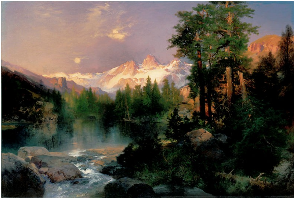
Figure 12: Thomas Moran, The Three Tetons , 1895. Oil on canvas, 20 5/8 x 30 1/2 in. Washington Historical Association, Washington D.C. (White House Collection).