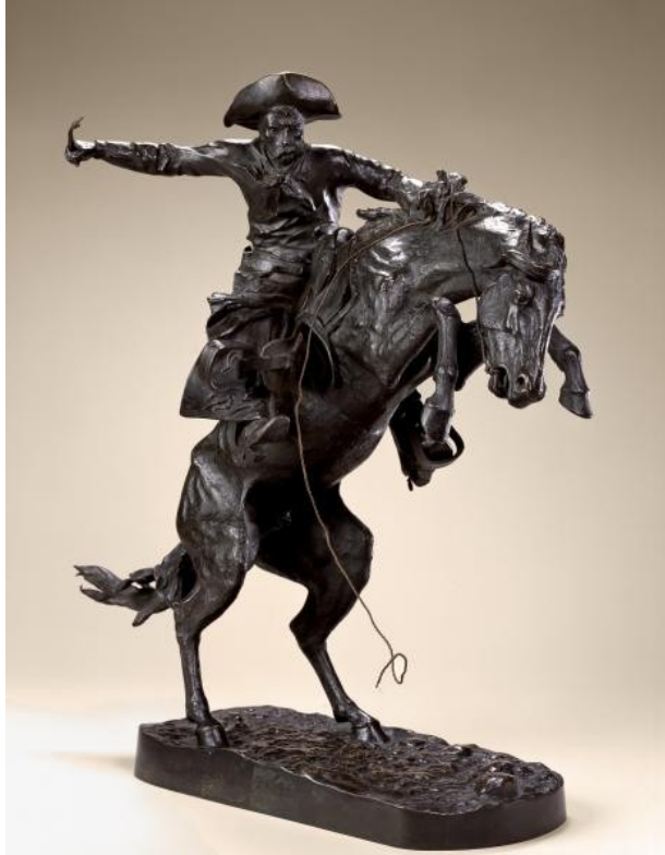
Figure 7: Frederic Remington, The Rattlesnake , ca. 1908. Bronze, 23 1/8 x 17 3/4 x 14 1/2 in. The Metropolitan