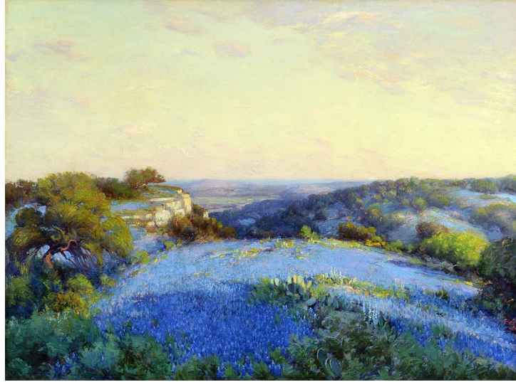
Figure 15: Julian Onderdonk, Near San Antonio , ca. 1918. Oil on canvas, 30 \frac{3}{4} x 41 in. San Antonio Museum of Art, San Antonio, Texas.

If we treat policies, rhetoric and art selections as different means to assess our presidents' visions of the West, they can reveal to us the overlapping Euro-American attitudes toward nature they serve. The fact that evidence of different presidents engaging with these different attitudes cannot be organized chronologically speaks to Limerick's argument. Though, as New York Times journalist Molly Ivins put it, the federal government acts, as "the landlord" of the West, owning "huge chunks of the West," the recent environmental record suggests it's easier for the president to engage with the territory as a story-telling aide. 173 A park like Grand Teton National Park becomes merely a beautiful image in a series of paintings, rather than an indication of the role a president takes on with the power to add to, expand upon, or cut funding to national parks and forests.