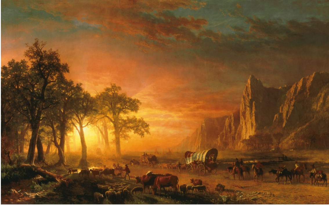
Figure 1: Albert Bierstadt, Emigrants Crossing the Plains , 1867. Oil on Canvas. The National Cowboy and Western Heritage Museum, Oklahoma City, Oklahoma.