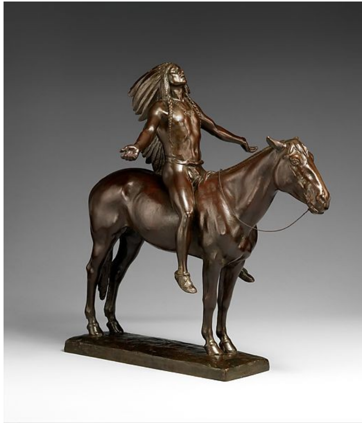
Figure 11: Cyrus Edwin Dallin. Appeal to the Great Spirit , cast ca. 1916. Bronze, 21 3/8 × 14 1/2 × 21 3/4 in. The Metropolitan Museum of Art, New York, New York.

Yet it seems the cultural trend towards re-evaluating frontier history has not lessened the persuasive appeal of suggesting that our destiny is simply a continuation of the journey the cowboys, miners and pioneers started. The following speeches given by Reagan, Clinton and Obama, give us permission to look upon a hero like Remington's The Bronco Buster , sitting in their respective offices, and believe that we follow in his footsteps. In some ways, the notion of continuity on the same journey that the pioneers started is mirrored by the continuity of the cowboy figure's display. It suggests that American leadership must still draw on the same repertoire of