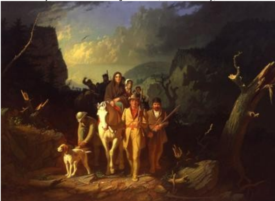
Figure 2: George Caleb Bingham, Daniel Boone Escorting Settler through the Cumberland Gap , 1851-1852. Oil on canvas, 36 1/2 x 50 3/4 in. Mildred Lane Kemper Art Museum, St Louis, Missouri.