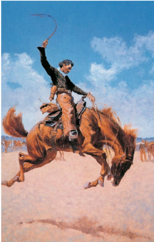
Figure 8: Frederic Remington. Bronco Buster , ca. 1895. Oil on canvas. Peter Newark's Western Americana, Bath, England. Frederic Remington and Emerson Hough. Remington (New York: Parkstone

dirt, exposure of every kind, no little toil and month after month of the dullest monotony.” 133