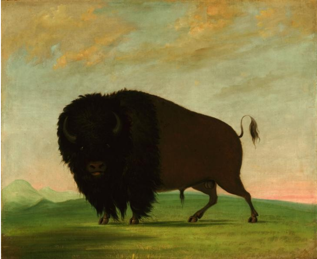
Figure 13: George Catlin, Buffalo Bull, Grazing on the Prairie , 1832-1833. Oil on canvas, 24 x 29 in. Smithsonian American Art Museum, Washington D.C.

Naturally, depictions of people, as they are associated with what they did and stood for in their lifetime, accrue more complicated cultural criticisms and nuanced cultural reception with time. In this body of research alone, we have seen this to be true of former president Andrew Jackson and of the glorified cowboy, due to a broadening of voices and perspectives included in academic and cultural spheres. But as stated in the introduction, this paper aims to view both portraits and landscapes in light of the complex and varied understandings of frontier history which have emerged in the last 40 years. 152 Images like Figure 12, Thomas Moran's The Three Tetons , or