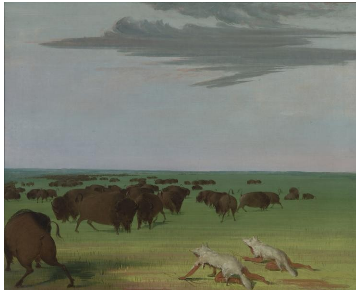
Figure 10: George Catlin. Buffalo Hunt under the Wolf-skin Mask , 1832-1833. Oil on canvas, 29 x 24 in. Smithsonian American Art Museum, Washington D.C.

settlement enacted against the Native American peoples inhabiting the Great Plains, Central Plains and Western coastal territories. It is also done by artworks which prize modes of representing Native American peoples through a Euro-American lens over those produced by individuals from the depicted tribes—Souix in the case of Dallin’s work and of an unspecified tribe in the case of Catlin’s work. 138 In speeches, we do not see presidents trying to broach this complex aspect of the frontier origin story. The cultural authority that Catlin was given, which one can see infer from letters written by Catlin to his eager Eastern audience, contributes to the historical dehumanization of Native Americans as simply another aspect of the Western territory which was previously unknown and discovered by American frontiersmen. 139