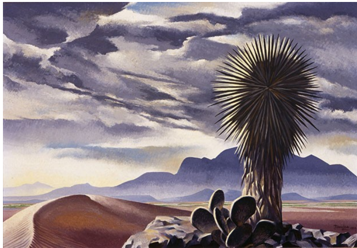
Figure 14: Tom Lea, Rio Grande , ca. 1954. Oil on canvas. El Paso Museum of Art, El Paso, Texas.

images, indicating an appreciation of nature among the given set of presidents, corresponds with a preservationist agenda or love of Western lands. In fact, When Secretary of the Interior Stewart Udall begged President John F. Kennedy to make a tour of Western states after winning only four Western states in 1960, he replied simply “I don’t know that I’ll enjoy it, but I’ll go.” 172 Echoing Limerick, their varying sympathies to regions of the West where nature is preserved, versus those where natural resources are used in industrial processes, tell us that it is not that simple.