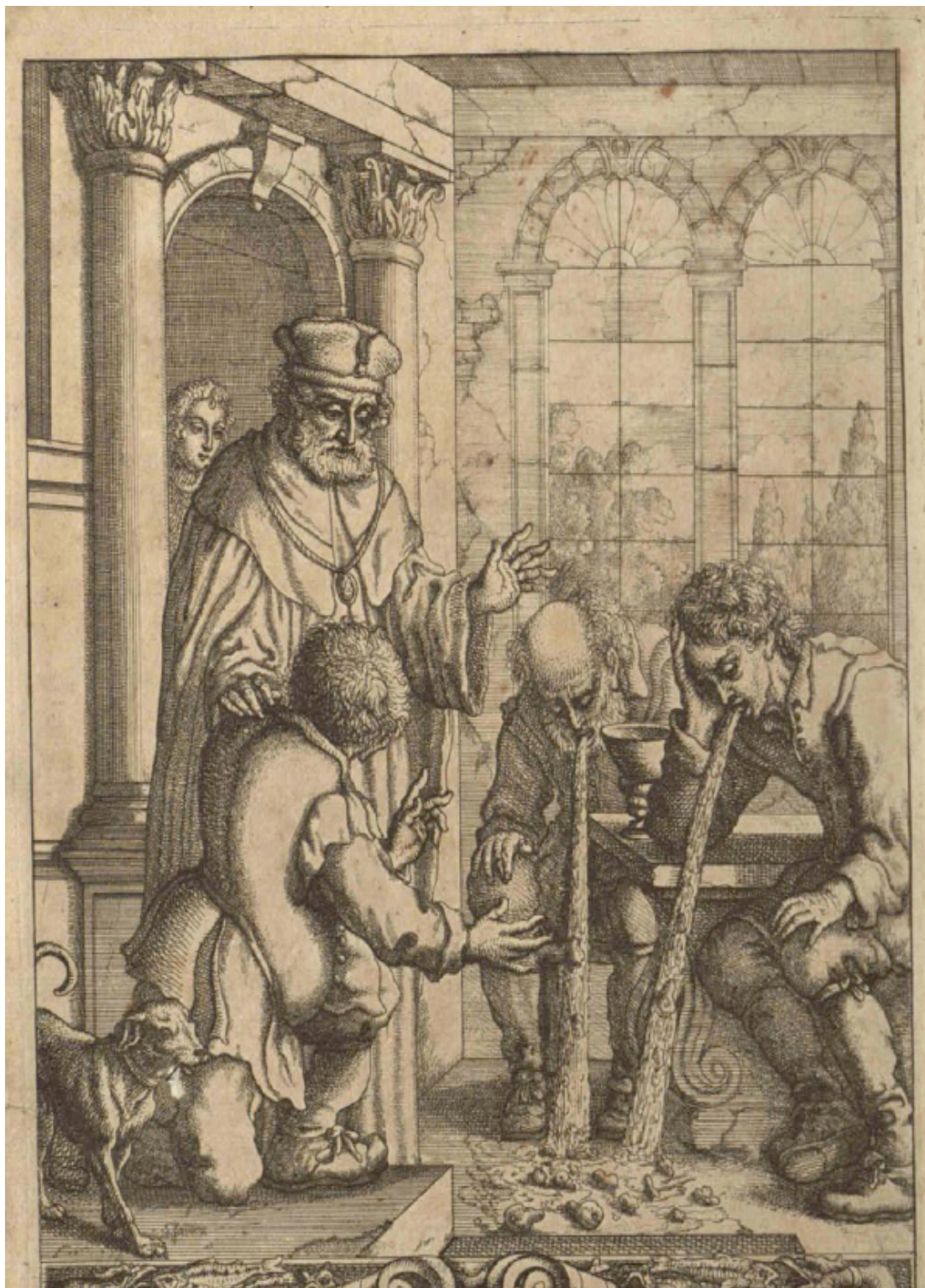
Figure 4.2: Aesop and the figs: another illustration from Barlow's Life of Aesop (1687).