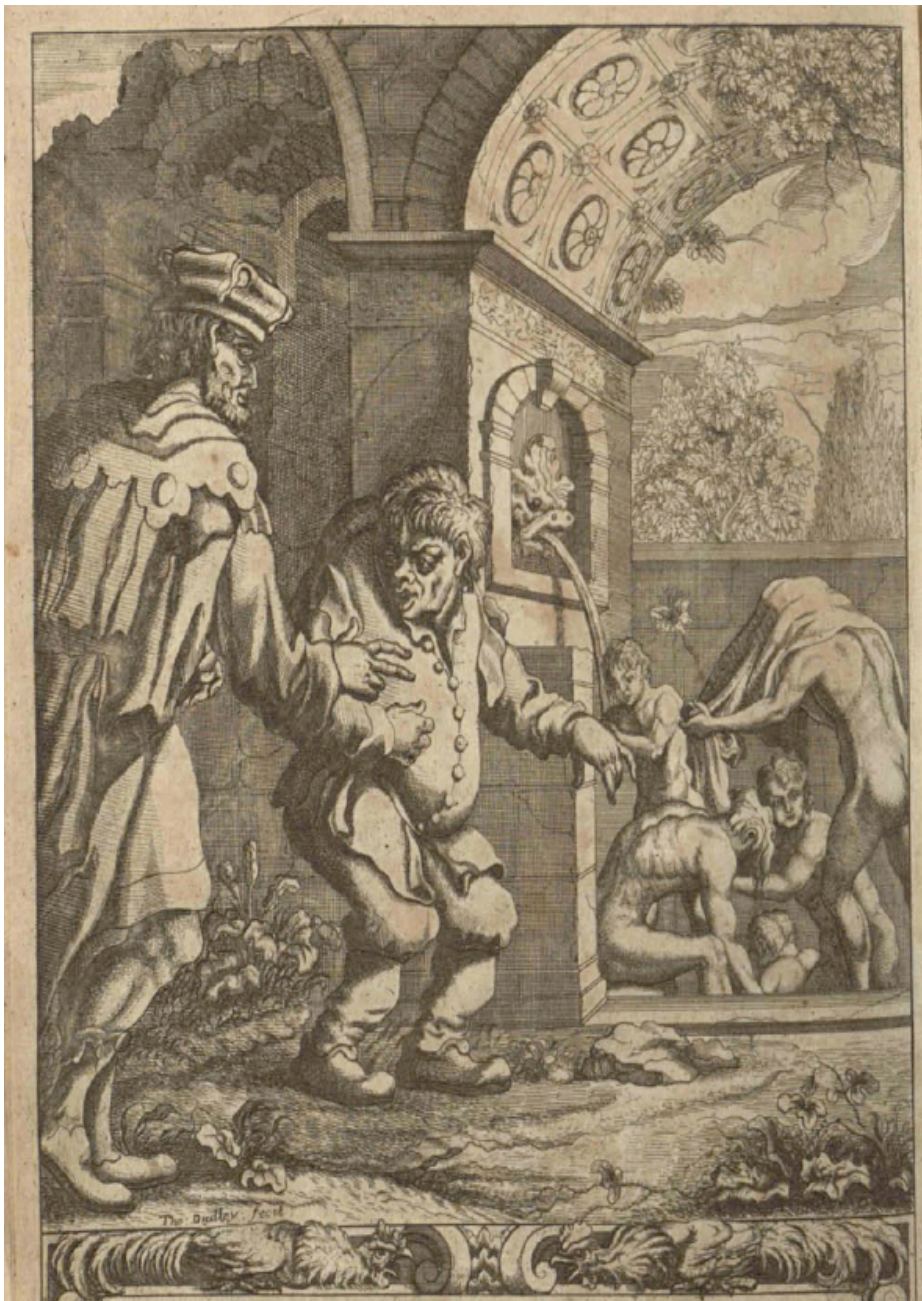
Figure 4.1: Æsop illustrated as hunchbacked and deformed in Frances Barlow's 1687 Life of Æsop . example, the author describes him as "Flat-nos'd, Hunch-Back'd, Blobber Lipp'd; a long misshapen Head; his Body crooked all over, Big Belly'd, Baker-Legg'd, and his

In the various representations of Æsop that I examine in this section, Æsop is portrayed as having an unusually-shaped body. In L'Estrange's 1714 version, for