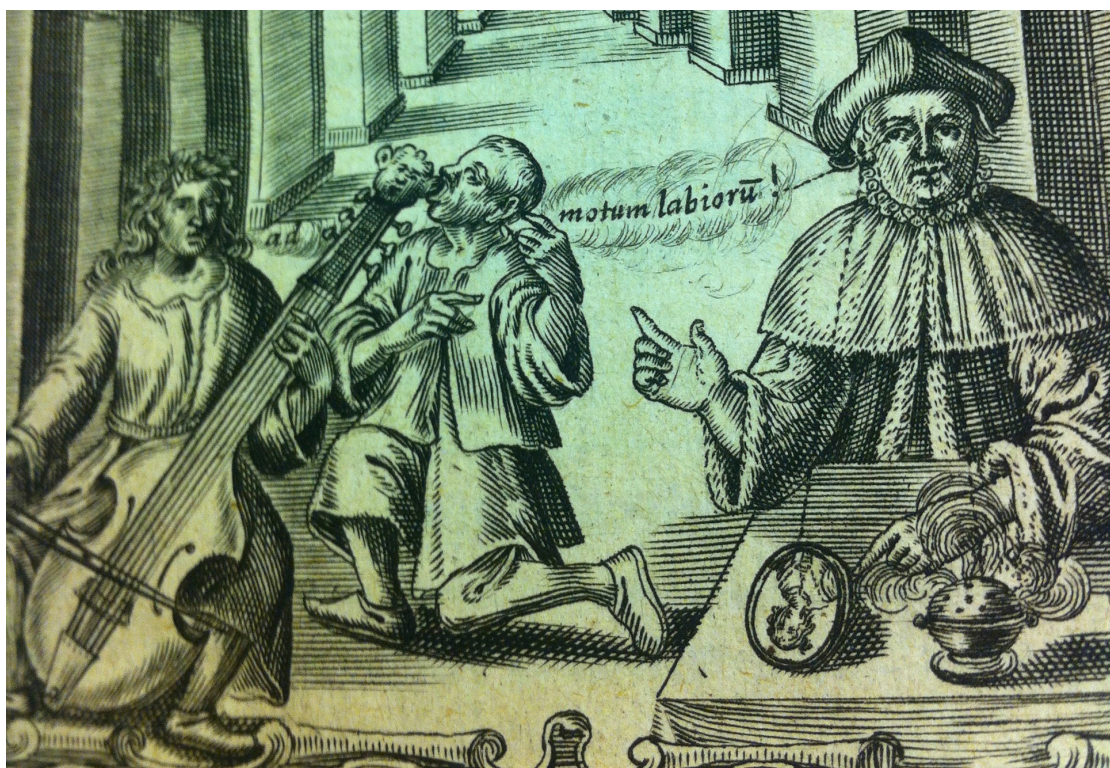
Figure 1.3: Frontispiece from John Bulwer’s Philocophus , an illustration which shows the community of senses at work.

very much in line with the frontispiece from Bulwer’s Philocophus (figure on next page), where a deaf man places his mouth near the tuning pegs of a bass viol so that he can hear the music through the cello’s vibration. The deaf man relies on his teeth to hear through a process called bone conduction—the funneling of sound from an external source to the inner ear by way of the bones in the skull. 19 Another figure, apparently blind, is able to hear the image of the woman in front of him, and can taste the scent of the incense that is perfuming the hall. These illustrated figures and Campbell can all experience outside world “in the utmost Perfection.” After all, as Bulwer notes, “sounds may be seen, felt, or tasted” (64).