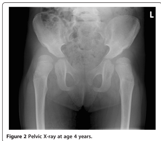
Figure 2 Pelvic X-ray at age 4 years.

As life expectancy of transplanted MPS I patients has increased considerably and total hip replacement is probably an important future treatment option for osteoarthritis of the hips in adult patients both early