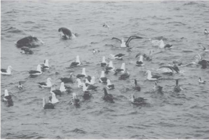
Fig. 2. Flock involving Antarctic fur seals, Black-browed Albatross, giant-petrels, Cape Petrels and a Gray-headed Albatross. To the upper right is a Black-browed Albatross with its wings open, the posture often seen before a dive. Also on the right a Black-browed Albatross is chasing a giant-petrel. The spatial arrangement evident here is typical, with the fur seals at the front, followed by the Black-browed Albatross, and with the giant-petrels at the rear. Note also the "gawky look" or puffed cheeks on the Black-browed Albatross.

frenzies were seen clearly, which enabled us to document fully the birds' behavior. These frenzies varied in duration (10–176 s; \bar{x} \pm SD = 43.8 \pm 55.3 ). The most common bird to arrive first at a new feeding site was the Black-browed Albatross (73.6% of 224 birds total). Giant-petrels (22.9%) and Gray-headed Albatross (3.6%) were the other active species. Of 148 observations of feeding attempts, 83.8% were by Black-browed Albatross, 8.8% by giant-petrels, and 7.4% by Gray-headed Albatross.