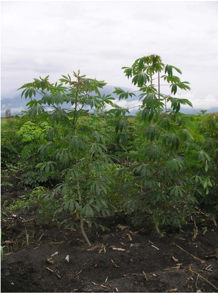
Figure 1. Field-grown cassava plants ( M. esculenta spp. esculenta ).

together with the unique properties of its starch make cassava suitable for particular food and nonfood applications [1,2]. It is consumed daily by more than 600 million people. It provides a cheap source of dietary carbohydrate energy ( 720 \times 10^{12} \text{ kJ day}^{-1} ) ranking fourth after rice, sugarcane and maize, and fifth among starch crops in global production [ http://faostat.fao.org ]. It gives reasonable yields in dry and poor soils and does not require high management level and cost compared to other major food crops.