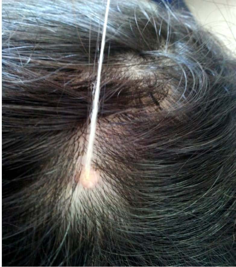
Figure 1: Skin-colored nodule with a central pore and wool-like tuft of hairs on the vertex

In conclusion, trichofolliculoma is a rare hair follicle hamartoma and a tuft of hair protruding from the center makes it even clinically diagnosable as was seen in the present case.