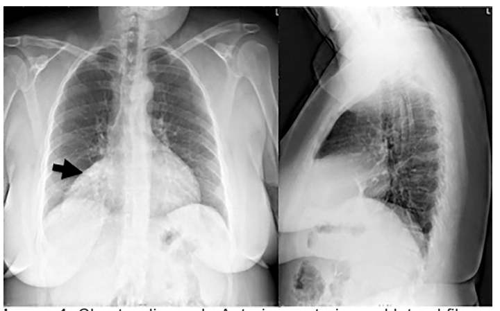
Image 1. Chest radiograph: Anterior-posterior and lateral films demonstrating anterior mediastinal opacity over the right heart border (arrow).