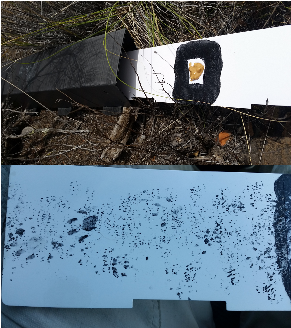
Figure 1. (Upper picture) A tracking tunnel (black tunnel; by Pest Control Research LP) with a peanut butter baited and inked tracking card ready to be inserted into the tunnel, and (Lower picture) a tracking card collected at Sandy Point National Wildlife Refuge, St. Croix, U.S. Virgin Islands, with tracks of mongoose (largest foot prints, in central and left side), rat (medium foot prints, at far right side, and lowest in center), and house mouse (smallest foot prints, or most abundant tracks of smallest dots visible).

minimized. Non-invasive methods also minimize animal stress (especially compared to live-traps or the momentary stress imposed by kill-traps); also, trap shyness is minimized, as is risk to non-target species. Finally, in areas where pest vertebrate species population suppression is occurring, these non-invasive techniques can provide a method of independent monitoring that allows one to assess the efficacy of target population suppression to help ensure management goals are met. For example, if bait