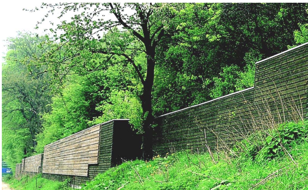
Figure 3.7. 3 m (10 ft) high wood noise barrier along a highway at the countryside adapted to the existing old vegetation at Highway M40 near Nyborg, Denmark [1].

In cases where a noise barrier is to be placed at the countryside, where the buildings are not situated close to the road, the barrier could be adapted to the road, the landscape and to the existing vegetation.