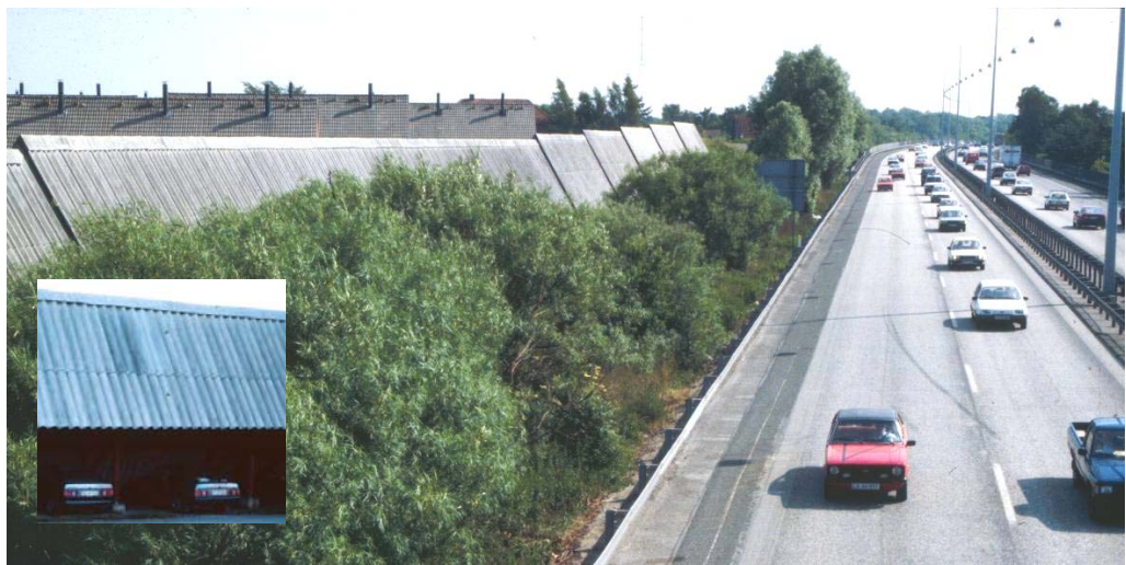
Figure 3.15. The roof of the carport construction for a residential row house area used as a high noise barrier along the M3 ring road around Copenhagen, Denmark [3].