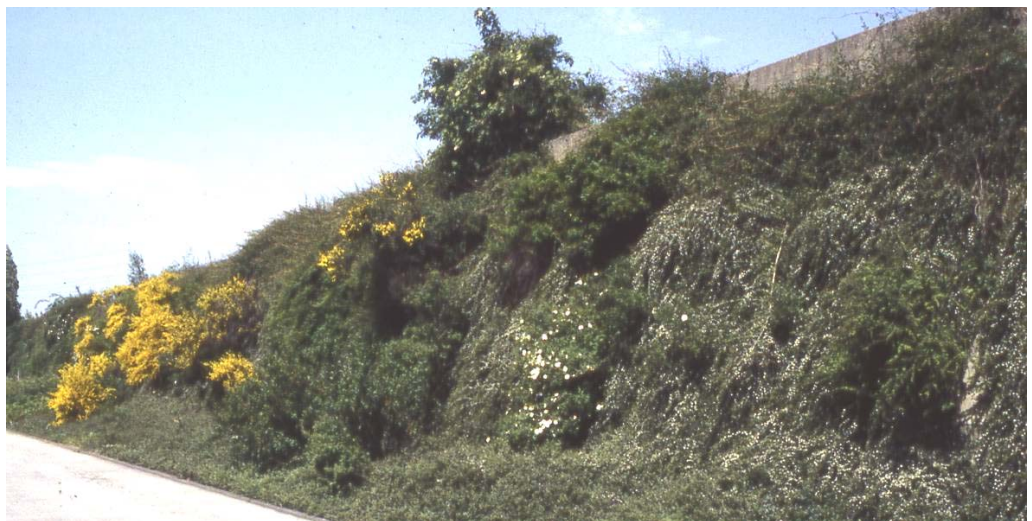
Figure 3.23. 7 m (23 ft.) high supported earth embankment with vegetation along Highway A3 near Cologne, Germany [3].