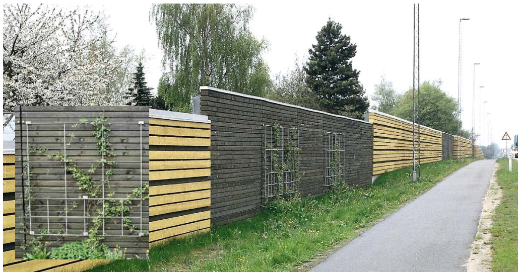
Figure 3.35. Wooden noise barrier with steel net to support vegetation at National Road 310 in Horsens, Denmark (detail to the left).