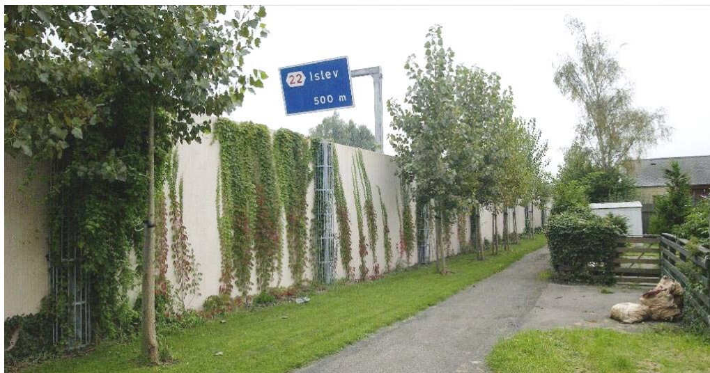
Figure 3.6. The residential side of a concrete noise barrier with vegetation along a high speed highway in Copenhagen, Denmark [2].

In cases where a noise barrier is to be placed at the countryside, where the buildings are not situated close to the road, the barrier could be adapted to the road, the landscape and to the existing vegetation.