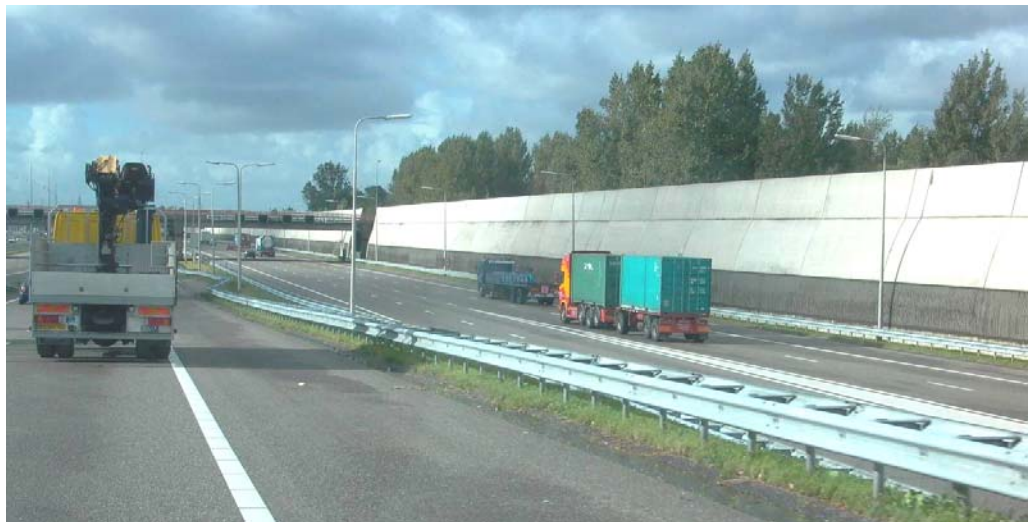
Figure 1.3. Noise barriers can be large structures which have an impact on the local physical environment. Shaped gray and white concrete barrier at a highway in the Netherlands.

Noise barriers and noise embankments are often relatively large and conspicuous structures which may not fit in with the surrounding environment. When a noise barrier has been erected, it represents a considerable economic investment and can be expected to remain standing for several decades. The people who live in the neighborhood of a noise barrier will have to look at the structure every day. This is also true for pedestrians, cyclists or motorists who daily pass a noise barrier. A noise barrier or noise embankment could therefore be regarded as a structure that has two facades, one facing the road and one the nearby town or landscape.