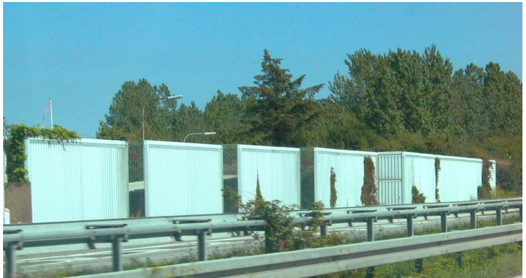
Figure 3.30. PVC barrier with vertical transparent elements along Highway M40 at Nyborg, Denmark.