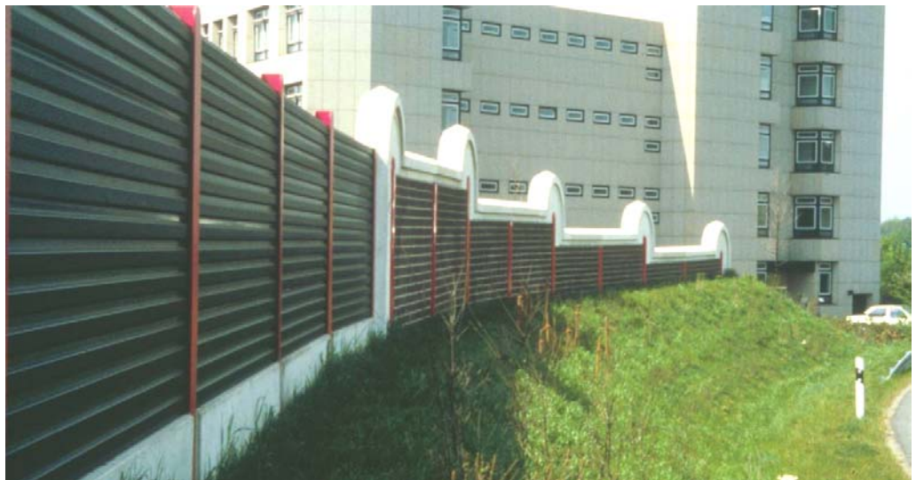
Figure 2.6. Noise barrier with reduced height at the end in Hanover, Germany [3].

In areas close to the end of the noise barrier its effect diminishes because the sound propagates around the end of the barrier. Therefore, the barrier should be continued some way past the noise-sensitive area or be concluded by a curve along the border of the area, away from the road.