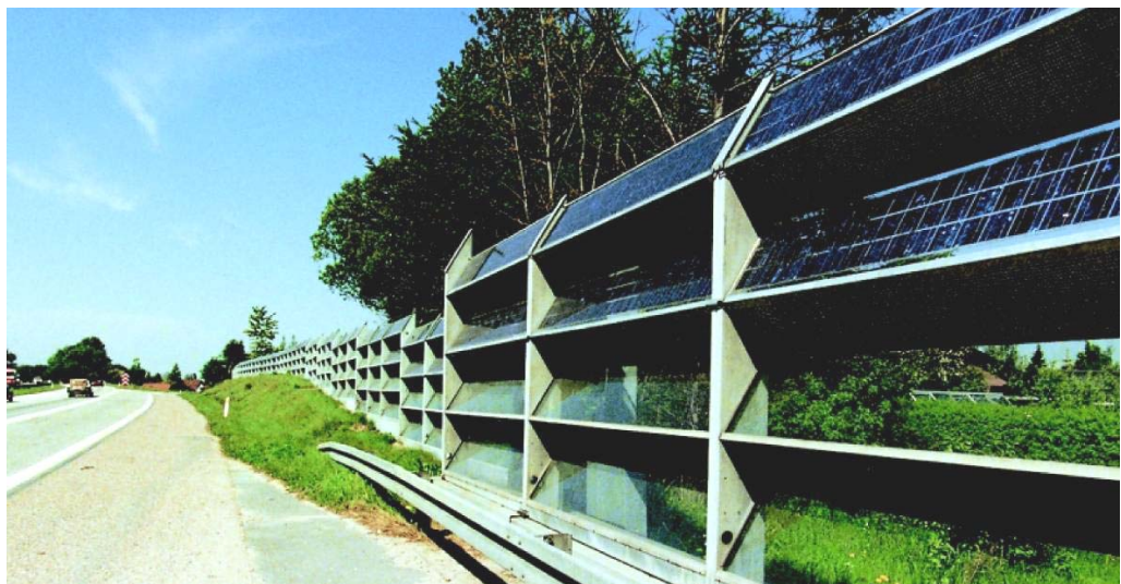
Figure 3.14. Transparent steel noise barrier with electric solar panels at the top. At Highway M11 at Fløng, West of Copenhagen, Denmark [1].