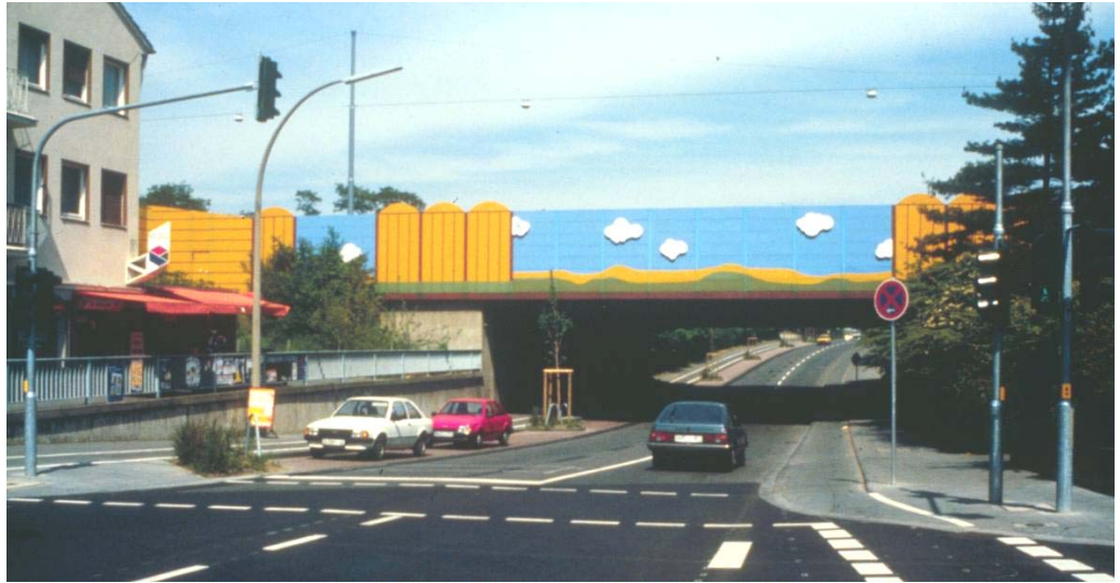
Figure 3.17. Noise barrier as a colorful urban element where Highway 555 in Germany passes on a bridge over a local road [3].