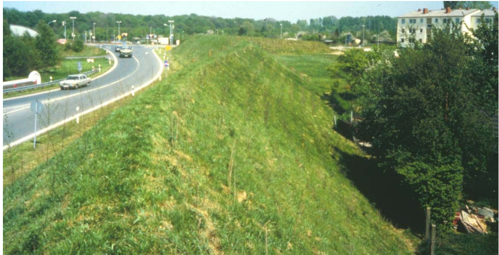
Figure 3.20. Earth embankment as a noise barrier in Germany.

If the desired barrier height is more than 4 to 5m (13-16 ft), it will often be easier to harmonize an earth embankment with the surrounding landscape than a noise barrier. As they require a relatively large amount of space, earth embankments will primarily be used in the countryside and in connection with areas where housing is less dense or scattered. In the course of a few years, a manmade earth embankment with vegetation will appear to blend in with nature. Earth embankments can have the effect of additions to the road environment and can enhance the natural character of the landscape.