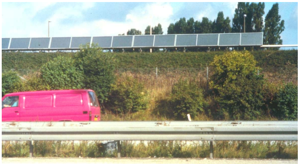
Figure 3.13. Earth embankment with solar panels on the top in Copenhagen, Denmark [3].