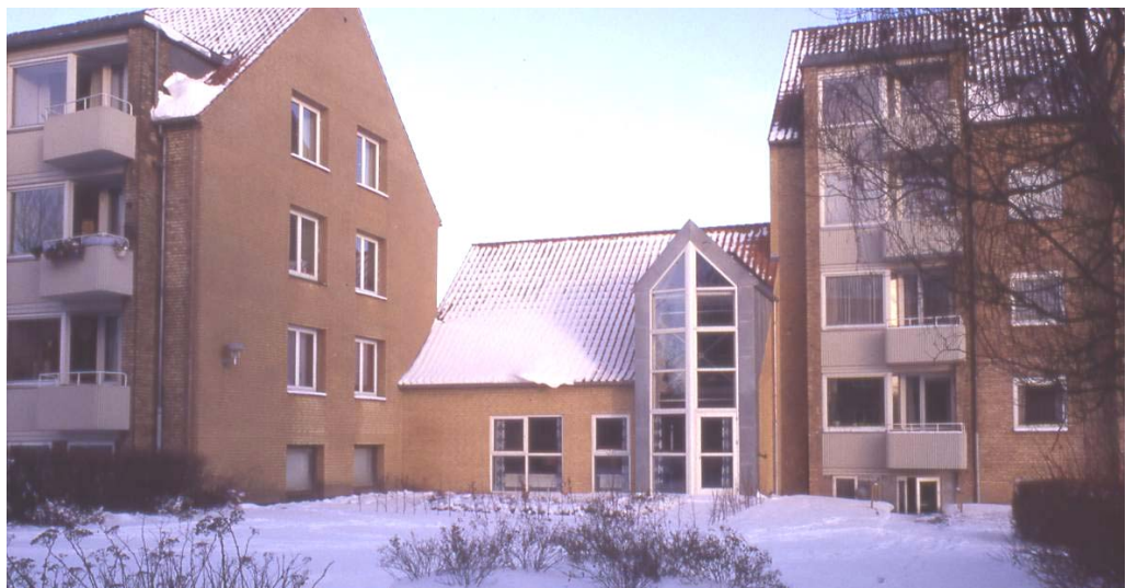
Figure 3.16. Two stories building with laundry and meeting room constructed between two apartment blocks also to function as a noise barrier for the road noise in the hole between the apartment blocks reducing the noise at the outdoor areas in Århus, Denmark.