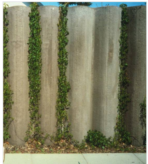
Figure 3.25. Colored concrete noise barrier made of 8 cm (3 in.) thick corrugated element with green vegetation at National Road 405 in Århus, Denmark [1, 3].

If vegetation is planted along a wooden barrier, this can, however cause maintenance problems, as the plants will have to be removed when the barrier is to be painted.