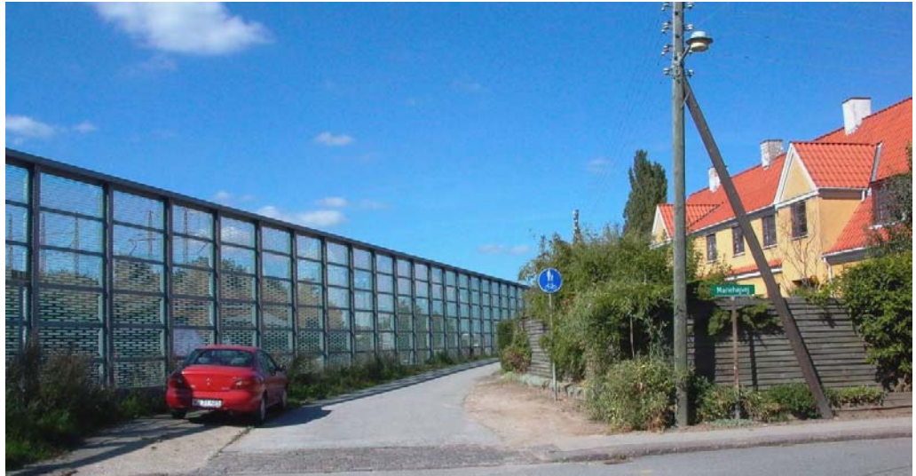
Figure 1.2. Noise barriers have a “back” side facing the nearby town or landscape. Transparent 5 m high noise barrier at Highway M14 north of Copenhagen, Denmark.