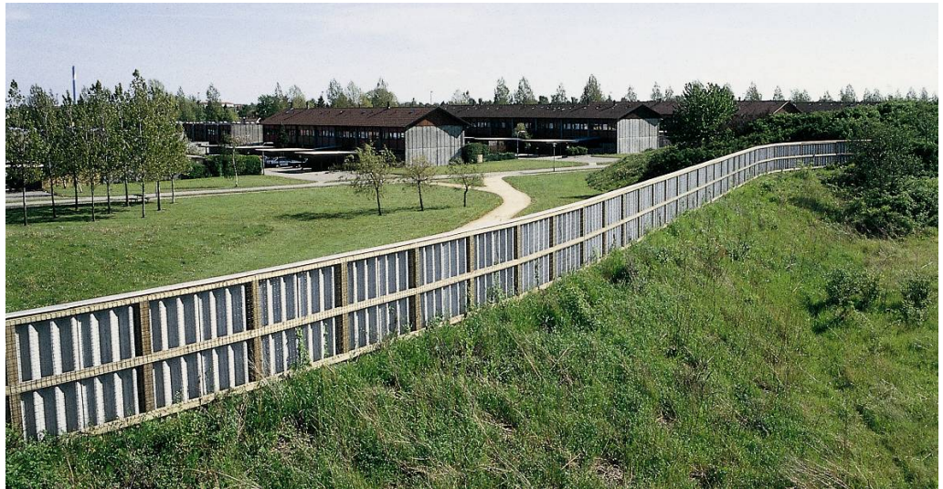
Figure 3.34. 1½ m high eternite (fiber cement) noise barrier with wooden frames on top of an earth embankment at Highway M10 in Greve vest of Copenhagen, Denmark. The barrier has steel net where plants can grow as times goes by [1].

It is necessary to give vegetation good growth conditions including access to sufficient water. At dry locations irrigating systems might be needed. Vegetation must have plenty of soil to grow in and while being protected from salt water from the winter maintenance of the road.