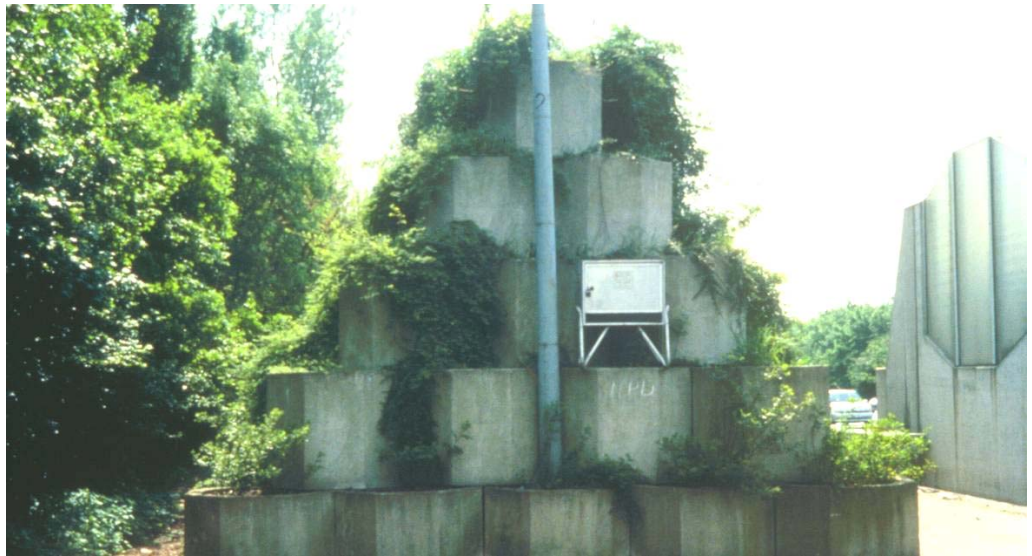
Figure 3.22. Supported earth embankment made of concrete pipes piled on top of each other in triangles and filled with earth along Highway A3 near Cologne in Germany [3].