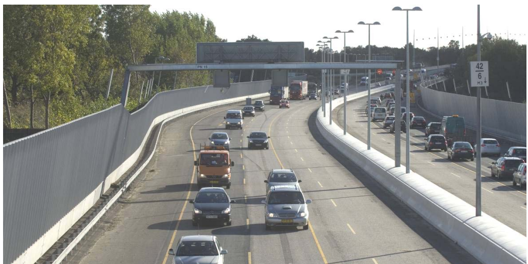
Figure 3.18. 4 m (13 ft) high aluminum absorbing noise barriers bent 10° towards the road along both sides of the M3 ring road around Copenhagen, Denmark.

Noise barriers and embankments should have a robust appearance and harmonize with the character of the road and its surroundings. However, they may also appear as deliberate contrasts to the surrounding in order to enhance weak but characteristic landscape elements. Finally, the barrier can stand out as a unique landmark. Furthermore, it is important to use materials that wear well, so that the appearance of the barrier does not become more and more shabby. A smooth surface will be perceived as being larger than a broken surface. The use of different materials, colors and of vegetation can contribute significantly to breaking the monotony of long and high noise barriers.