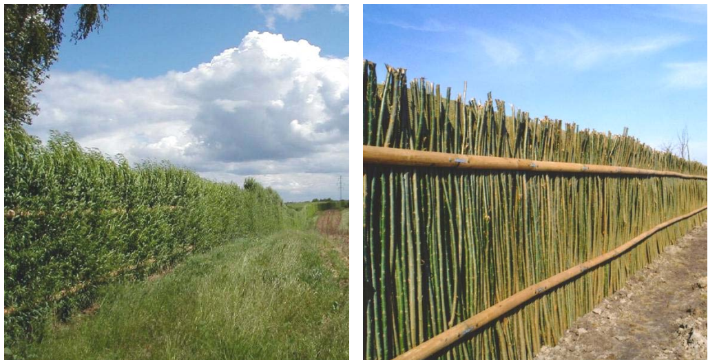
Figure 3.36. Green noise barrier made of panels with willow branches at both sides. When newly constructed to the right and after getting green to the left [2].