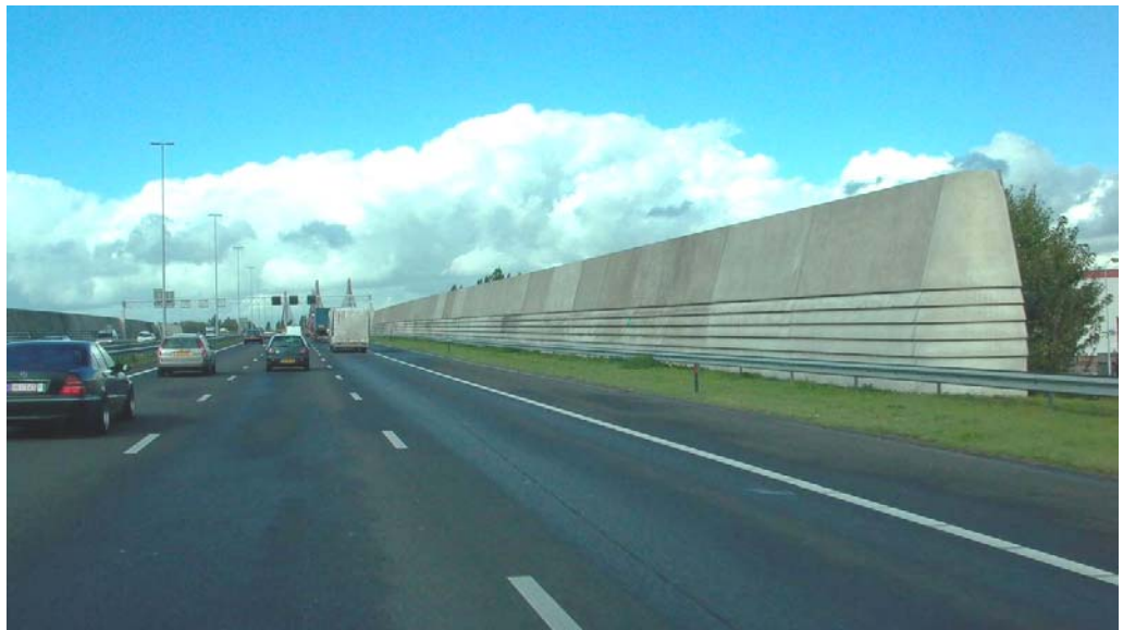
Figure 2.10. Dutch concrete noise barrier bent at a small angle from the road in order to reflect the noise upwards to reduce the disturbance of residents on the other side of the highway.

There are different solutions to reflection problems deriving from noise screening installations. These solutions involve different visual impacts, which can make their mark on the surroundings of the road. The barrier can be erected at a slant so that the noise is reflected up into the air, where it will not disturb anyone (see Figure 2.9 and 2.10). For an earth embankment with sloping sides this will always be the case.