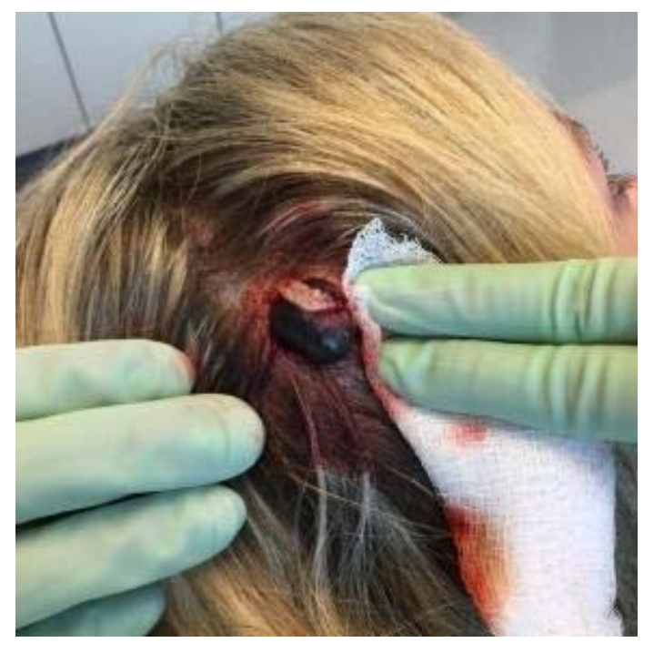
Figure 2 . Intra-excisional view of a giant pigmented hidrocystoma presenting as a skin-colored 3.0\times3.0 cm nodule on the right parietal scalp.

Compared to eccrine hidrocystomas, apocrine hidrocystomas more commonly present as solitary lesions (multiple lesions are associated with Gorlin-Goltz syndrome and Schopf-Schulz-Passarge syndrome), [9], produce oily/foamy secretions, and microscopically demonstrate multiple cystic spaces that may be uni- or multi-loculated with papillary