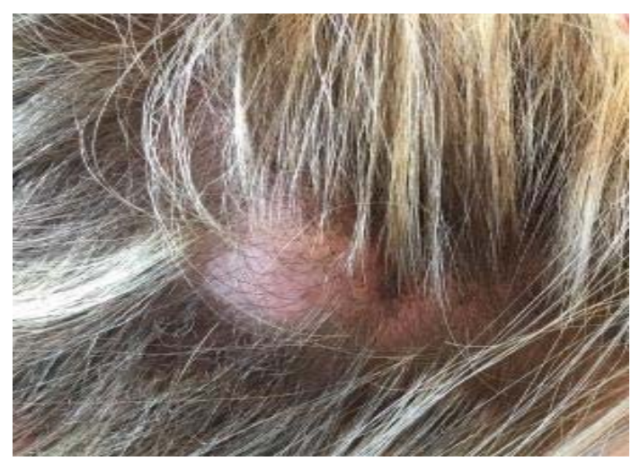
Figure 1 . Pre-excisional view of a giant pigmented hidrocystoma presenting as a skin-colored 3.0\times3.0 cm nodule on the right parietal scalp.