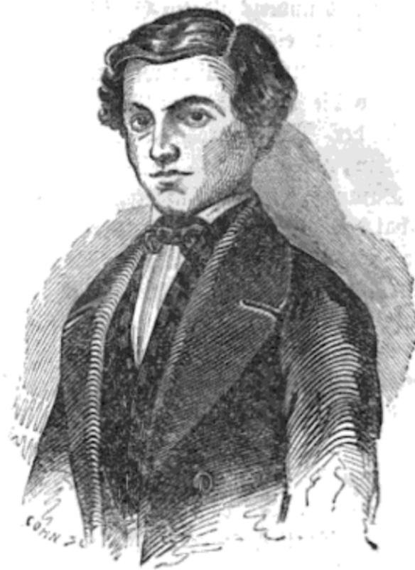
Fig. 2. Carl Spitzer, as depicted in a lithograph published by the new Jewish newspaper. 43

Jewish journalists played an important and visible role in promoting the discourse of middle-class unity through the press. Former Jewish entertainment journalists hailed the formation of the National Guard and the heroism of the young students and protesters who had brought about the changes of March 15. Ludwig Frankl's poem "The University," the first publication printed after the granting of press freedom, commemorated University of Vienna students by drawing attention to their heroic militarism. 44 The first two stanzas depicted the young men as valiant soldiers, marching to the beat of a drum: