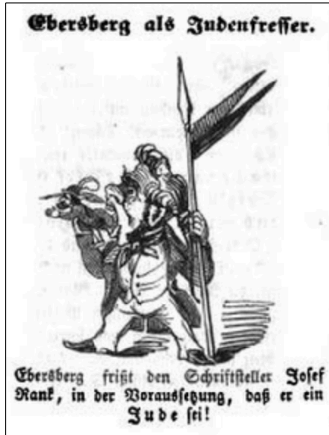
Fig. 4. When the Zuschauer accused non-Jew Josef Rank, beloved short-story writer of the Vormärz and radical editor of 1848 paper Volksfreund , of being both a Jew and a “cowardly, pathetic, and vile mudslinger,” not only did Rank deny both accusations himself, but Wiener Katzenmusik , edited by two Jewish radicals, ran a cartoon about the exchange. The cartoon featured Ebersberg as a “Jew eater”—a slang way of referring to an anti-Jewish person—swallowing Josef Rank “on the assumption that he is a Jew.” 92

conservatives even started “accusing” non-Jewish radical journalists of being Jews in an effort to discredit their “scandalous” lack of moral restraint and immature, inflammatory politics (Fig. 4). The Jewish man, for conservatives, came to be a metonymic stand-in for “unruly politics,” just as the “radical man” came to be a metonym for “Jew.”