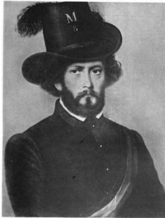
Fig. 1. Ludwig Frankl in uniform as an Academic Legionnaire. Portrait by Joseph Matthäus Aigner (1849). 32

the Vormärz for exclusively “political” topics, and the Academic Legion in its early iteration adopted the same militaristic masculinity of the National Guard. Like guardsmen, legionnaires wore military costumes, engaged in heated debate and decorous pageantry, and participated in new political processes across the city and empire. So evident were the similarities between the groups that some professionals chose not to join the National Guard but rather to become legionnaires, as in the case of editor Ludwig Frankl. A portrait of Frankl from the time shows