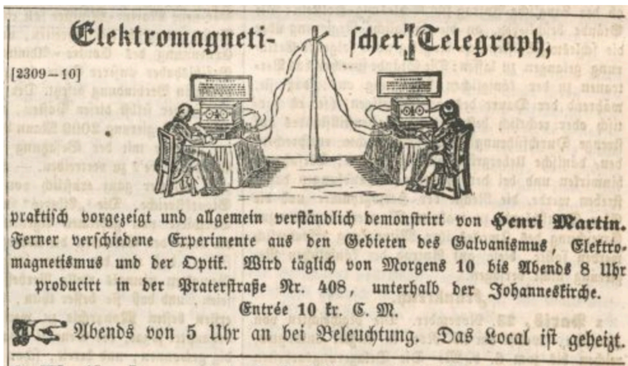
Fig. 9. Advertisement in the Lloyd for a public telegraphy demonstration in 1849. November 29, 1849. 64

The changes experienced in journalism and celebrated by journalists also occurred because Habsburg state ministers adopted a new approach toward state governance and public opinion. As discussed above, Christopher Clark argues that instead of viewing the 1850s as a reprise of post-Napoleonic restoration across Europe, the state strategies implemented in the 1850s sought to control and direct public opinion—a form of “news and information management—rather than to stifle it.” 65 Melischek and Seethaler discuss this argument as it applied specifically to Habsburg attitudes toward the Viennese press. 66 Both Clark and Robert Evans suggest that the 1850s should not be viewed as a period of reaction, as previous historians