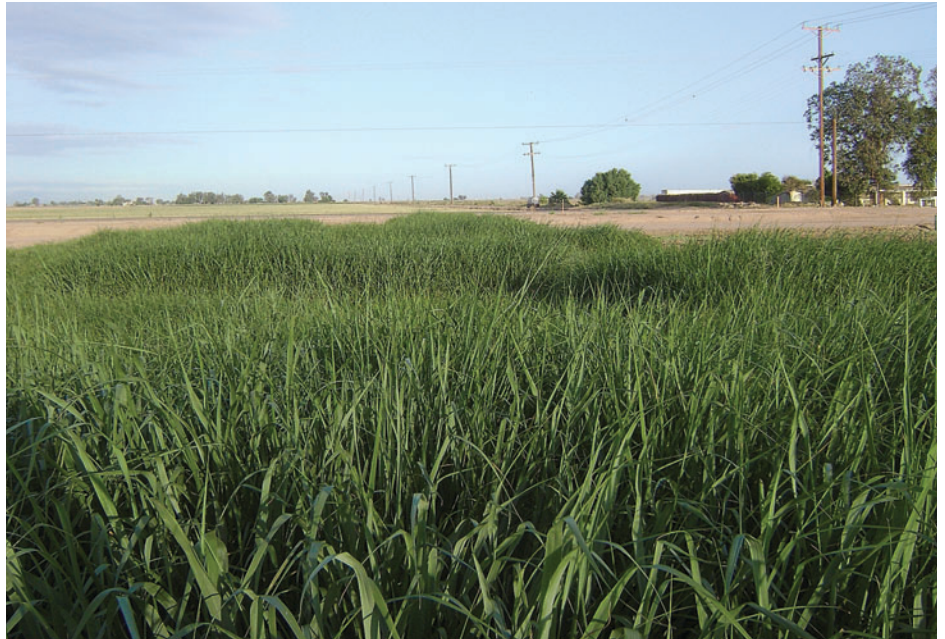
Switchgrass is a grass native to North America that has been utilized primarily as a forage crop and groundcover. Because of its high biomass yields, switchgrass (above, in El Centro, Imperial County) is considered a good candidate for dedicated energy crops (biofuels).

California consumes more ethanol than any other U.S. state. California