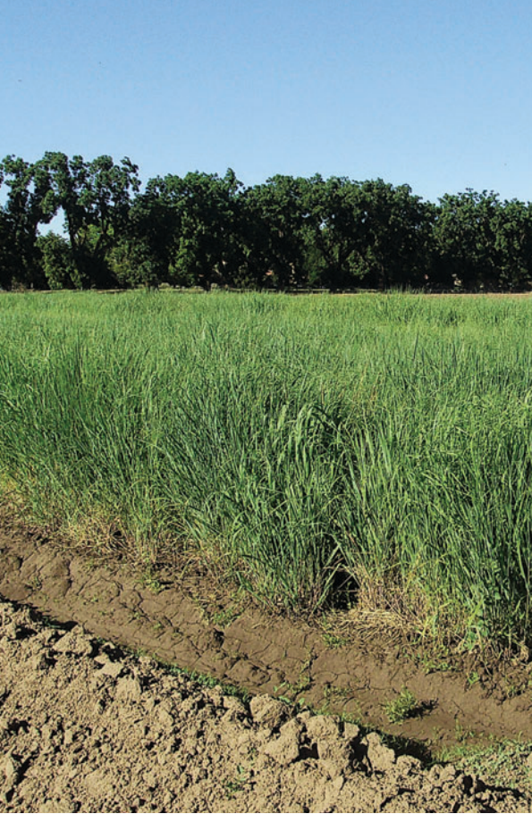
Nitrogen fertilizer will likely be needed for switchgrass crops to achieve their full yield potential. Above, switchgrass is tested in Davis in June, about 1 month before the first harvest.

significant yield response when the two highest nitrogen treatments were compared to the plots that received no nitrogen. This suggests that over time switchgrass depleted the native soil's nitrogen reserves and required fertilizer nitrogen to achieve its yield potential. Muir et al. (2001) reported just such a situation: switchgrass depleted native