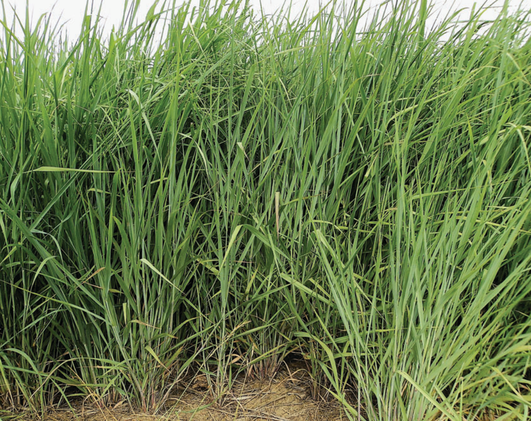
In the first full production year, plots of lowland switchgrass in El Centro yielded 17.6 tons per acre. The crop's productivity tends to increase through the third and fourth years.

0.25 inch (0.6 centimeter) and with 10 inches (25.4 centimeters) between rows. Plot size was 10 by 15 feet (3 by 5 meters). The plots were sprinkler irrigated after seeding to ensure good germination. No fertilizer was applied at planting, but at the three-leaf stage nitrogen (N) was applied in the form of ammonium sulfate at a rate of 50 pounds per acre (56 kilograms per hectare).