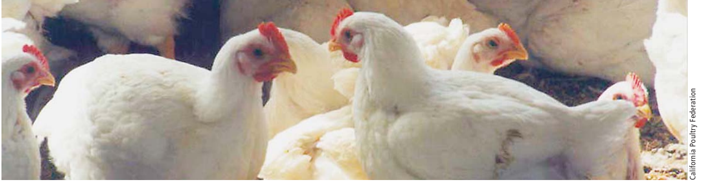
California Poultry Federation

had no significant effect on measured production parameters.