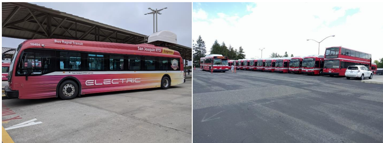
Figure 2: Electric Bus operated by San Joaquin Rapid Transit in Stockton, California (left). Bus depot with electric fleet in Davis, CA (right).

While these are ambitious efforts, the SEMARNAT is one of the agencies with diluted political strength and support. If the current political trends continue, it is unlikely that the path toward electrification in the transportation sector can gain significant momentum. Mexico’s international and domestic climate commitments depend on a shift in the current practices and policies.