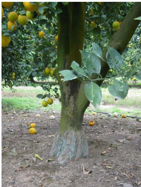
Fig. 1. Typical exocortis bark scaling in Valencia sweet orange on Carrizo citrange rootstock.

Moderate symptoms were characterized by mild stunting and mild epinasty. Mild symptoms were a very mild leaf epinasty affecting only a few leaves.