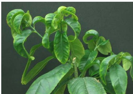
Fig 2. Severe epinasty induced by pure Citrus exocortis viroid.