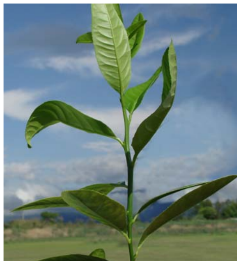
Fig. 3. Mild viroid leaf symptoms induced in citron.

In addition, inoculated citrons were analyzed by sequential polyacrylamide gel electrophoresis (sPAGE). Nucleic acid extraction and sPAGE were done according to Duran-Vila et al. (1). The results showed that viroids were present and most of the infections were mixtures of two or more viroids (Fig. 4). A summary of a characterization of different isolates is given in Table 1. All 22 viroid isolates are being maintained at the Citrus Sanitation Center of the EEAOC at Tucumán, Argentina. Further characterization will be done using PCR.