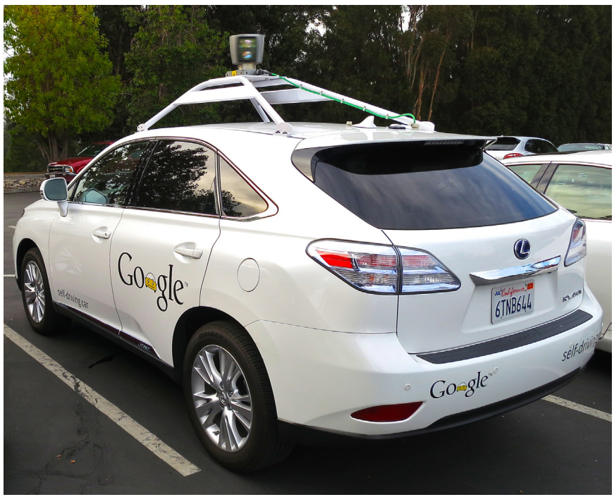
Lexus RX450h retrofitted by Google for automated driving

that part of the confusion arose because the different developers and manufacturers were talking about radically different vehicle automation system concepts when using the same imprecise terminology.