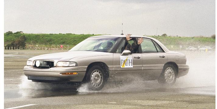
No hands vehicle test

The first few years of PATH research featured pioneering studies on automation concept evaluation and explorations of several of the key enabling technologies to determine basic technical feasibility. A large-scale evaluation of the impact of highway automation on the Los Angeles region was performed using the regional transportation planning models of the Southern California Association of Governments (SCAG). The traditional 4-step SCAG regional model was modified to represent the capacity increases that could be achieved by automating one to three lanes in each direction on the major freeways in the region, showing the potential for significant reductions in congestion throughout the network. The key enabling technology studies included: