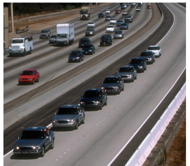
NAHSC 1997 Demo in San Diego

This Congressional mandate, which unfortunately was not accompanied by a dedicated funding stream, led to a large upsurge of national activity on highway automation. PATH was an active participant with several of the teams that won projects under the FHWA Automated Highway System Precursor Systems Analysis program in 1993-4, and was also a partner with Honeywell, developing operational concepts for the initial study of the human factors issues associated with automated driving. When FHWA solicited proposals for a national consortium to develop and test a prototype automated highway system, PATH and Caltrans had such unique qualifications in this field that they were the only organizations chosen to be on both of the teams that competed for that national consortium, one led by General Motors and the other led by TRW and Ford. The General Motors-led team won that competition and became the National Automated Highway Systems Consortium (NAHSC). PATH was one of the nine core participants in the NAHSC and had the largest single share of the NAHSC work of any of the participants (about 25% of the labor, representing about 30 full-time people).