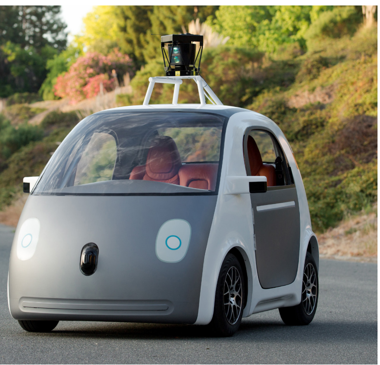
Google's most recent prototype automated vehicle concept does not include tradi-tional driver's seat or controls

One topic of particular importance to the DMV was investigating the alternative models of safety certification. In the U.S., vehicle manufacturers self-certify that the vehicles they build meet the Federal Motor Vehicle Safety Standards (FMVSS), but currently there are no FMVSS for automated vehicles, nor are there any SAE or ISO voluntary standards for automated vehicles. PATH investigated models of safety certification used in the rail industry, by the EPA, and even the third-party safety process certifications commonly used in the European automotive industry. Although each certification model has advantages and disadvantages, there is no clear best