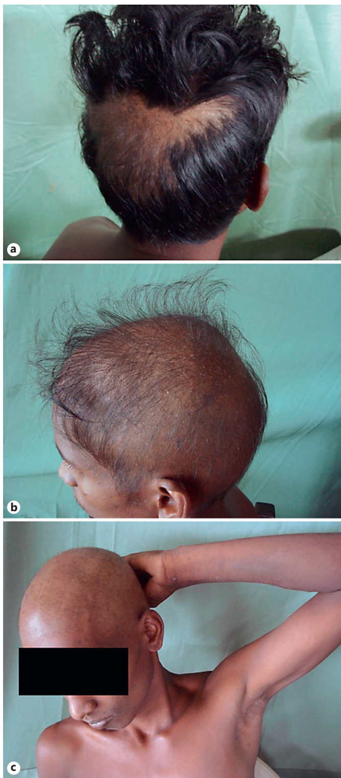
Fig. 4. Alopecia after intentional ingestion of G. superba [45]. A 26-year-old male ingested harmful amounts of colchicine from a natural source, G. superba . The patient is shown at 9 days after poisoning with onset of hair loss (a), at 11 days (b), and at 14 days (c), demonstrating loss of scalp and axillary hair.

pec by day 14 (Fig. 4) [45]. Senthilkumaran et al. [37] reported a similar case of a 20-year-old male who consumed tubers, instructed by a traditional practitioner, and experienced diffuse loss of scalp hair 6 days later.