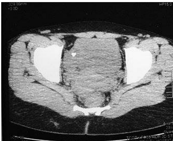
Figure 2. Axial non contrast CT showing the radiopaque content of the teratoma (tooth).

The right ureteric orifice was identified and guide wire introduced, under fluoroscopic guidance followed by ureteroscopy revealing absence of the presumed stone while the radiopaque shadow did not change its place. Surprisingly, a preliminary diagnostic cystoscopy revealed a 2 cm rounded, whitish lesion, arising from the right lateral wall of the bladder with a stalk like base and