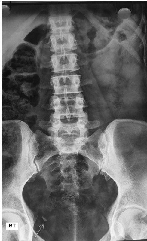
Figure 1. KUB showing a radiopaque 1 cm lesion in right uretero-vesical junction area.

Upon consultation, we ordered a non-contrast helical CT, which confirmed the established diagnosis (Fig. 2). The somewhat antero-lateral location of the calcification raised the suspicion that this may represent a calculus in an ureterocele; suggesting the reason for failed MET. Subsequently we offered the patient ureteroscopic lithotripsy indicated by previously failed medical therapy.