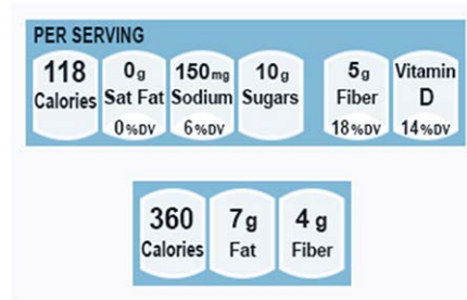
Figure 1. Front of Package (FOP) symbols for cereals ( top ) and frozen entrées ( bottom ).

of those appearing on frozen entrée packages (e.g., Smart Ones, Marie Callender). Samples of the types used in the present study are shown in Figure 1.