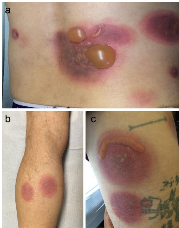
Figure 1. Well-defined erythematous-violaceous patches with bulla over the back (a), legs (b) and thighs (c).

He noted five identical episodes since October 2012, with lesions always appearing in the same spots; three of the episodes occurred after being treated for upper respiratory infections. The eruptions generally resolved spontaneously and turned brownish. The patient's medical history was relevant for asthmatic bronchitis, for which he was treated with daily oral montelukast since 2010. Sporadically, in the past two years, he also took paracetamol, ibuprofen, naproxen, diclofenac, hydroxyzine, ciprofloxacin, levofloxacin, bromhexine, loperamide, and simethicone. After a cutaneous biopsy was performed, he was treated with a short regimen of oral prednisolone (0,5mg/kg/day).