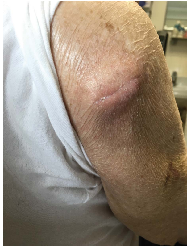
Figure 2. The mass 2 months after initial biopsy. It had regressed from 5 × 3.5 cm to 4 × 3 cm, and the overlying incision was healing well.

identified deep to the fascia, clinically concerning for a soft-tissue sarcoma. A 4-mm punch biopsy was made through the fascia into the deeper tissue for diagnosis, and the incision was closed primarily in a layered fashion.