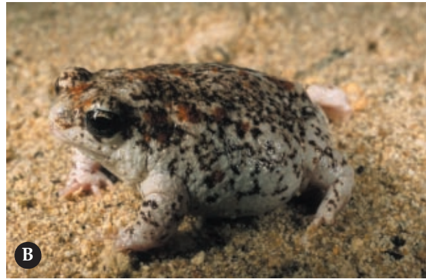
Figure 2 A, Arenophryne xiphorhyncha sp. nov. from type location (Coolomia Station, Western Australia); B, A. rotunda also from the type location (False Well Entrance, Shark Bay, Western Australia).

snout. There are usually conspicuous darker paravertebral stripes on the back, along with dark irregular markings. There is a lighter vertebral area with a thin clearly demarcated yellow to cream stripe running from the back of the head to the urostyle where it is more clearly seen. Raised tubercles and folds on the dorsum are often tipped with the pale ground colour. There are often scattered deep red flecks present on the dorsum and some yellow flecks present on the sides, especially near the groin. The belly is pale with stippling or irregular blotching with a semi-translucent abdomen.