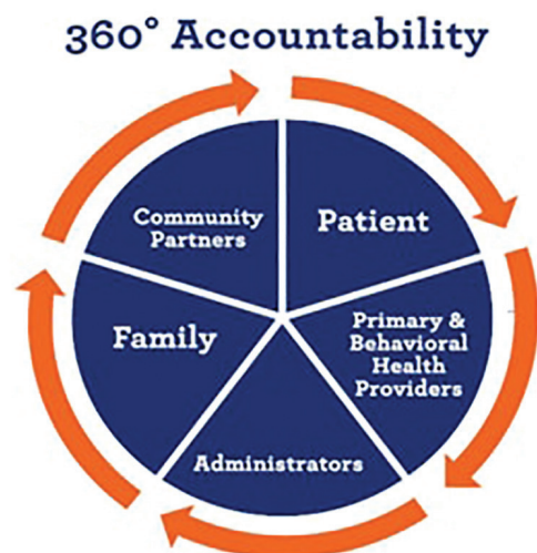
Figure 3. 360-degree Accountability

the care team's structure or current processes – or both. Clearly defined roles and responsibilities and the involvement of multidisciplinary team members throughout the patient experience should serve to improve patient outcomes. Other promising practices include: workflow redesign that may include task grid checklists; the establishment of multidisciplinary COPD clinics, at which pulmonologists, respiratory therapists, pharmacists and other central care team members might provide ongoing care to those with COPD under one roof; patient-centered teams in which patients and caregivers serve a central role in determining what is best for the individual patient and process-oriented programs.