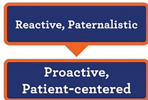
Figure 2. Models of Care

An orientation toward proactive, patient-centered care must be adopted and actively implemented (see Figure 2). 17 Providers and health systems should embrace processes and employ tools that support them to this end (e.g., risk assessment, an effective approach to predictive modeling and identifying patients vulnerable to readmission, that can support care delivery decisions well before discharge). Adopting a focus solely on readmissions reduction is likely misdirected; if health teams and their organizations commit to a culture of improving care quality for COPD patients, readmissions rates will likely decrease as a natural result.