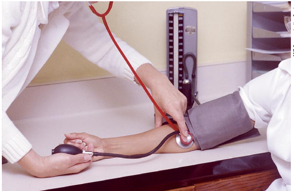
ANR Communication Services

► To establish a cost-benefit relationship, the amount of money saved by delaying a disease or condition for 5 years was estimated. Blood pressure monitoring can help to detect heart disease, hypertension and stroke risks.