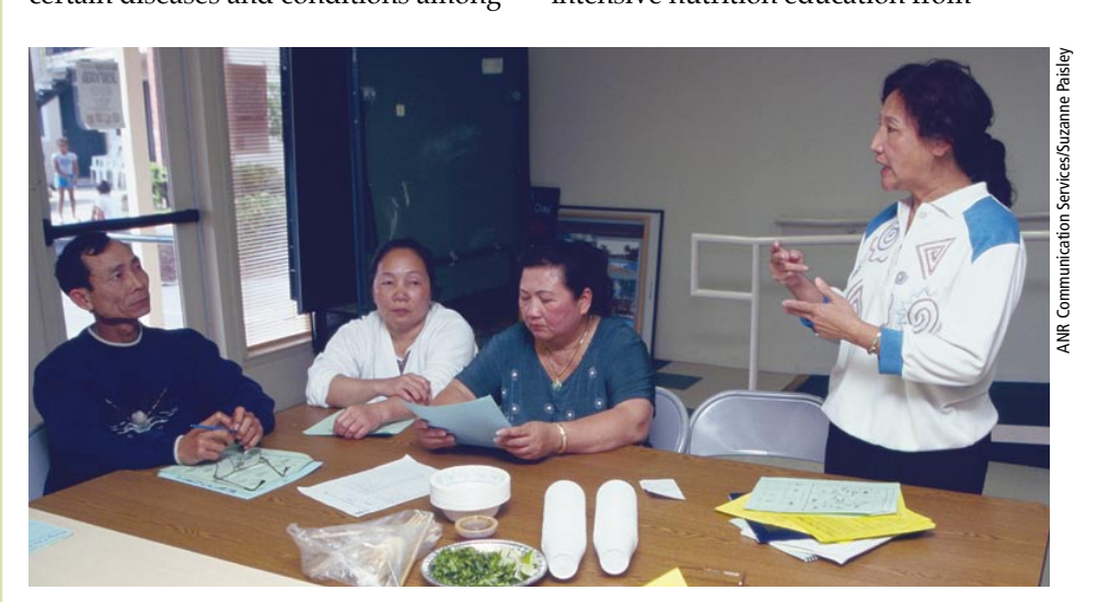
EFNEP provides 4 to 6 weeks of classes in a small-group setting to more than 13,000 low-income California families each year. The program is administered by UC nutrition scientists and educators.

The EFNEP program (in both Virginia and in California) teaches low-income families how to purchase, safely prepare and serve a balanced, highly nutritious diet. The program emphasizes the increased consumption of fruits and vegetables, decreased consumption of fat, and improved skills in food safety, preparation and shopping, with the long-range goal of improved health and risk reduction for chronic diseases. The 1990 Dietary Guidelines for Americans were the basis for instruction during the time of this study (USDA/DHHS 1995), although the recently updated version is currently used. Participants receive intensive nutrition education from