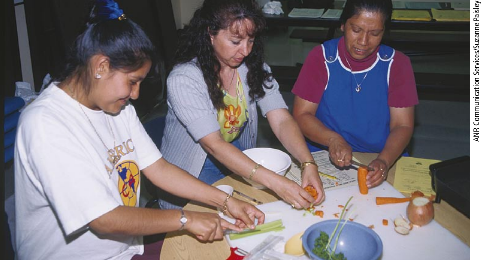
The impact of nutrition education on health care spending has not been extensively studied; the authors utilize a new cost-benefit analysis methodology, developed by Virginia researchers, to quantify nutrition education impacts in California. Top , a mother receives health counseling at a WIC clinic in Virginia. Above , California EFNEP participants learn healthy cooking choices.