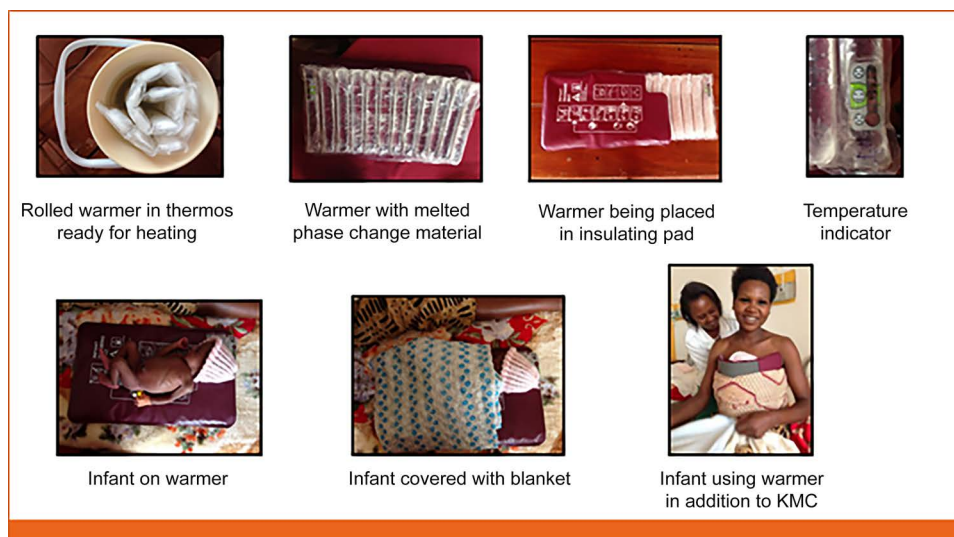
FIGURE 1 Infant warmer.