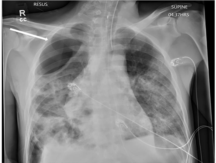
Image 1. Post-intubation chest anterior-posterior radiograph demonstrating pneumonia and gigantic bulla (white arrow).

ECMO team agreed that due to the complicated nature of the patient's disease process and underlying severity of lung injury he was an appropriate candidate for VV-ECMO. The patient was taken emergently to the operating room and received a right ventricular assist device, and VV-ECMO was initiated.