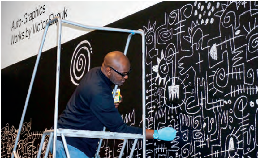
Victor Ekpuk working on his wall drawing, Lathrop Gallery tripartite wall, in conjunction with the exhibition Auto-Graphics: Works by Victor Ekpuk , Lathrop and Jaffe Galleries, Hood Museum of Art, Dartmouth College, Hanover, New Hampshire, April 18–August 2, 2015.