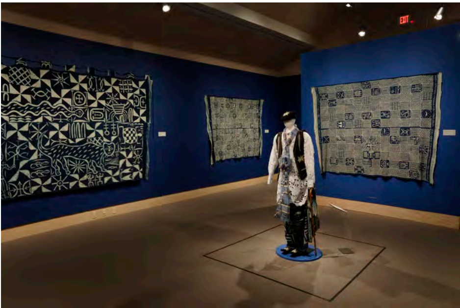
Ukara: Ritual Cloth of the Ekpe Secret Society , Hall Gallery, Hood Museum of Art, Dartmouth College, Hanover, New Hampshire, April 18–August 2, 2015.