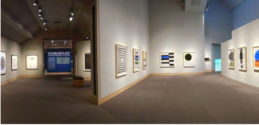
Victor Ekpuk's wall drawing as of noon on Thursday, April 23, 2015, Lathrop Gallery tripartite wall, in conjunction with the exhibition Auto-Graphics: Works by Victor Ekpuk , Lathrop and Jaffe Galleries, Hood Museum of Art, Dartmouth College, Hanover, New Hampshire, April 18–August 2, 2015. Photo by Alison Palizzolo. © Victor Ekpuk