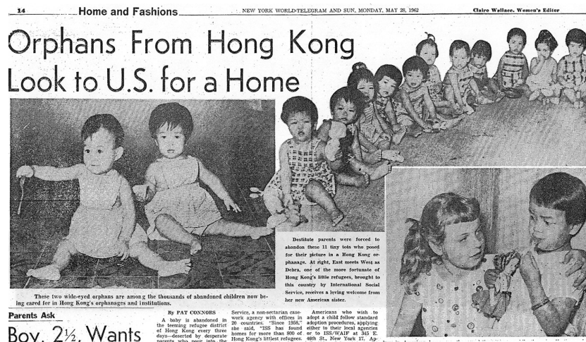
Figure 2.2. The ISS-USA collected news articles about the Hong Kong Project in its administrative files. This 1962 news story vividly depicted the plight of abandoned children in Hong Kong and the role of the ISS-USA in arranging the international adoptions of these children by American families.

The second event—a 1962 special flight of forty-eight Chinese children arriving at the Los Angeles airport for adoption by white American and Chinese American families across the United States—garnered even more publicity. A news article from the Los Angeles Herald-Examiner