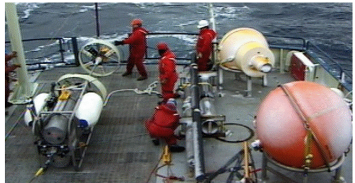
Figure 3: The AOSN docking components on the deck (left) and an omnidirectional approach to docking (right). 14,15

The wire latching system, in contrast, is a design that can charge any AUV regardless of its shape or size. The most developed design comes from a collaboration between the MIT Sea Grant Laboratory and the Woods Hole Oceanographic Institute's Autonomous Ocean Sampling Network (AOSN) Dock. This docking station is a vertical latching system composed of a V-shaped titanium latch along a spring-loaded capture bar secured on the nose of the vehicle. In order to latch to the station, the AUV drives into the long vertical docking pole and pushes the capture bar aside with its forward momentum. The latching operation is entirely passive, which allows the AUV to be kept at the station for safety even during a power outage. In order to undock, the vehicle releases the capture bar through a rotary actuator and withdraws from the pole. AOSN was