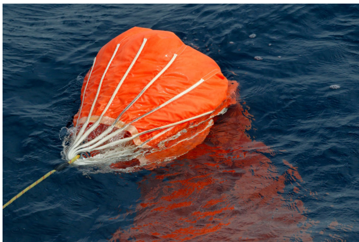
Figure 1: Example diagram of an off-the-shelf para-anchor. 4

parachute that uses water pressure to stabilize a sea vessel. It provides a counterforce to waves lifting up the ASV by pulling a cord linked to the spring loaded mooring line spool. While the ASV will move with the movement of the water's surface, the small amount of power lost to sea-anchor movement is minimal in comparison to the amount of power and space necessary for a full anchor and winch to secure the WEC.