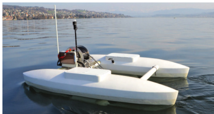
Figure 2: The C-Cat 3 ASV from L3Harris (left) and Autonomous Warrior 2018 (right) that this ASV design is modeled after. 5,6

Lithium ion batteries charged by both the WEC and solar panels will be the primary power source. Using lithium ion batteries was a natural choice given their prevalence and relatively high power density (above 200 Wh/kg) in comparison to the lead acid battery (under 50 Wh/kg). 10 The batteries will be placed in two groups aboard the catamaran, one at the bottom of each hull. This positioning would provide greater stability and safety for the craft because the batteries weight will be focused to the lowest and widest possible locations in the craft. The ability to separate the battery into two sections provides redundancy in the case of failure within one battery compartment. Based on current battery standards, about 20 kWh of storage capability will be introduced onboard, which is