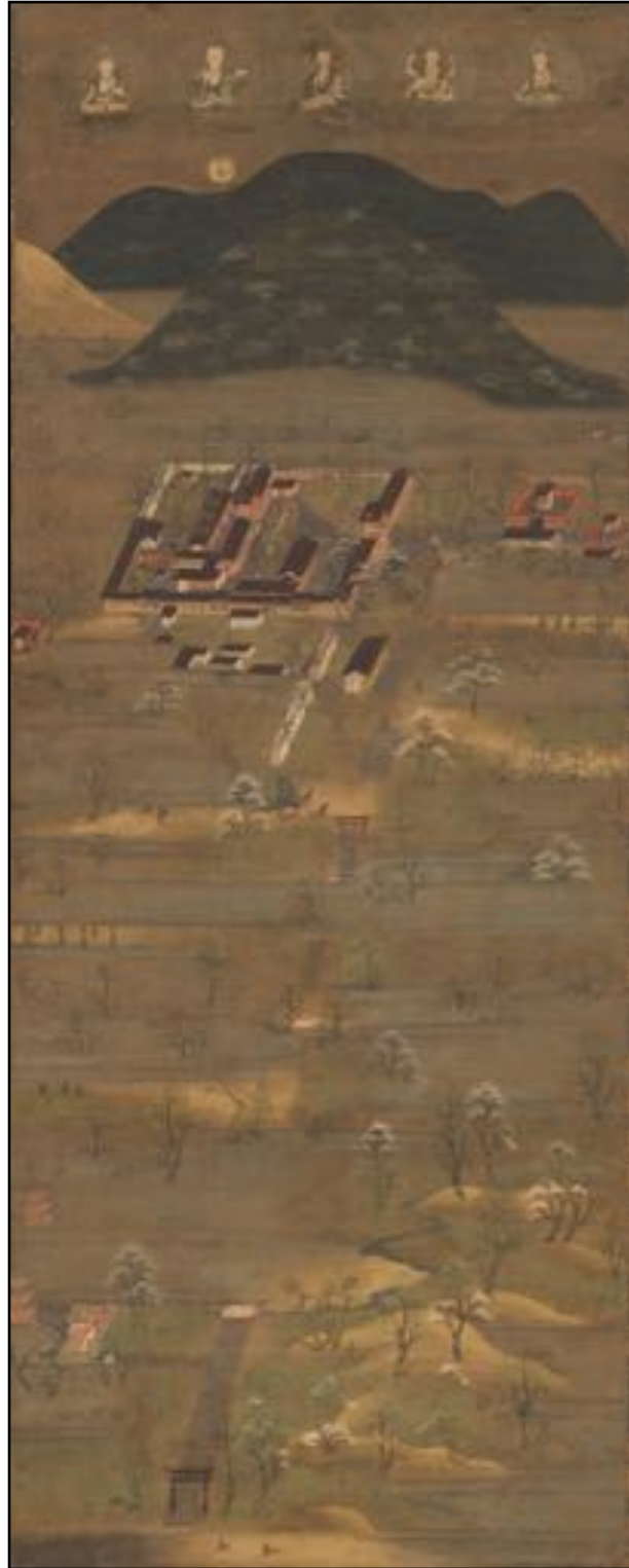
Figure 5. Mandala of Kasuga Shrine , hanging scroll, Kamakura period (early fourteenth century). Ink, colors, and gold on silk, 99 x 40 cm.