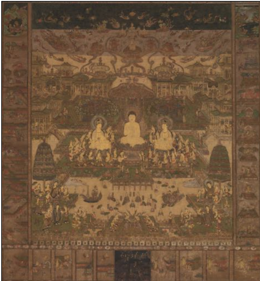
Figure 4. Taima mandara , hanging scroll, Nanbokuchō period (late fourteenth century). Colors and gold on silk, 133.4 x 121.9 cm.

also used for virtual pilgrimage. In his diary, Gyokuyō , the courtier and regent Fujiwara (Kujō) Kanezane, describes such a virtual pilgrimage to Kasuga Shrine taken through a Kasuga mandara from his home in the capital in Juei 3 (1184). Or rather, in Kanezane's case, the shrine traveled to him. After a series of elaborate rituals and offerings before the painting, Kanezane declares in his diary: "I and others confirmed in our dreams that the shrine had come here. It is truly worthy of belief." 6 Whether it is the viewer or the site that spiritually travels, the painting serves as a medium or point of access to the sacred place.