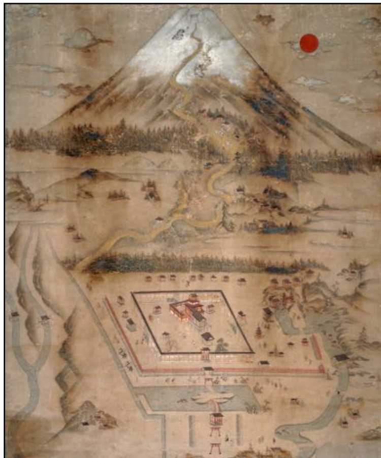
Figure 11. Fuji sankei mandara , hanging scroll, Edo period (seventeenth century). Ink and light colors on paper, 126 x 103.2 cm. Fuji Hongū Sengen Shrine, Shizuoka.

and may therefore be attributed to Motonobu. Motonobu died in 1559, a year before the death of Imagawa Yoshimoto, so we may further conclude that the Hongū A mandara was painted while Murayama was still ascendant in the mid-sixteenth century. In the Hongū B mandara , Asama's main hall is represented as a one-story structure, an indication that it was probably painted before Tokugawa Ieyasu's 1604 reconstruction, when the hall was rebuilt with two stories, as we see it represented in later mandalas (figure 11). It is of course possible that the painter referred to an earlier representation of the main hall, but the style of painting and the type of silk used indicate that it is a sixteenth-century work. Moreover, if the grounds had been rebuilt at the time the Hongū B mandara was painted, why would the Asama patrons who commissioned it to promote their shrine have chosen to illustrate the hall in its less illustrious form? We may therefore conclude that both paintings date to the second half of the sixteenth century.