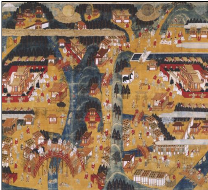
Figure 8. Ise sankei mandara , hanging scroll, Muromachi period (late sixteenth century). Ink and colors on paper, 171.4 x 186 cm. Jingū Chōkokan, Mie Prefecture.