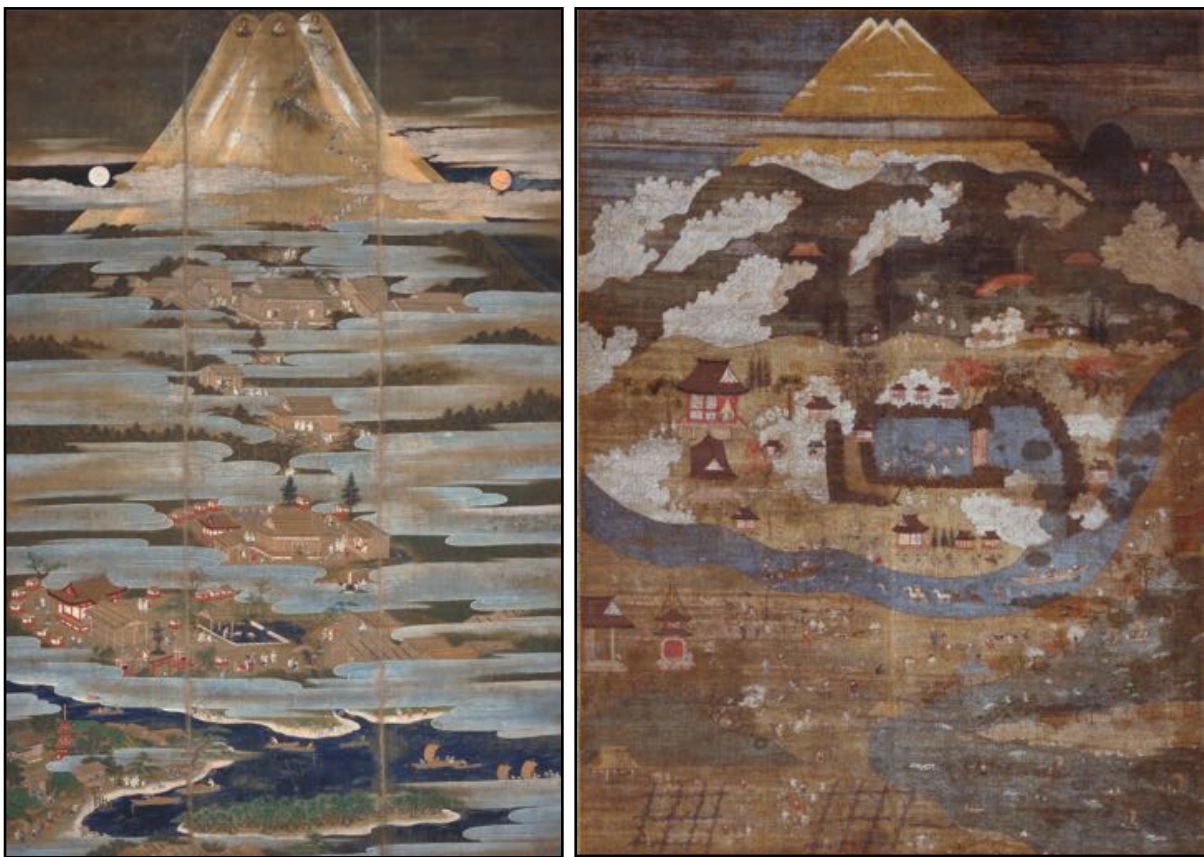
Figure 9 (left). Fuji sankei mandara , hanging scroll, Muromachi period (sixteenth century). Ink and colors on silk, 186.6 x 118.2 cm. Fuji Hongū Sengen Shrine, Shizuoka.

In addition to being cosmological maps and guide maps to religious sites, sankei mandara also contain a layer of manipulations concerned with more earthly matters, discernible when comparing the mandara devoted to illustrating the same sacred site. The small differences between the compositions of the different mandara and their representation of architectural and figural details encode such historical conditions as local conflicts among religious sects and within the religious hierarchy; deciphering these subtleties requires close inspection of the paintings' details together with a knowledge of the site's institutional and economic histories.