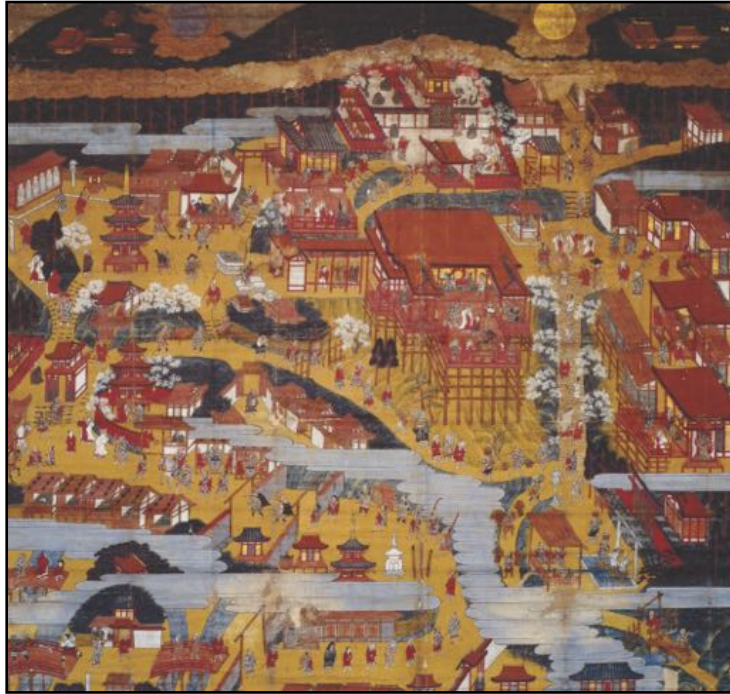
Figure 7. Kiyomizudera sankei mandara , hanging scroll, Muromachi period (late sixteenth century). Ink and colors on paper, 168.5 x 176.8 cm.