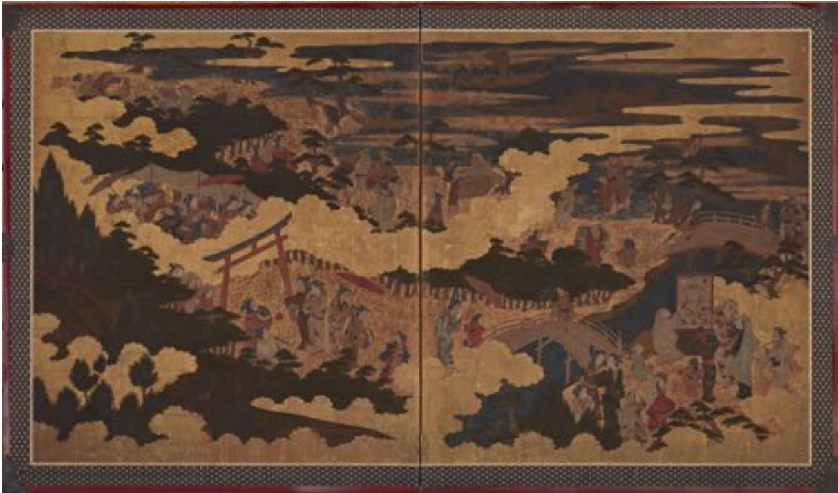
Figure 6. A Festival at Sumiyoshi Shrine , pair of two-panel screens (left screen), Edo period (early seventeenth century). Color and gold on paper, 95 x 171 cm. Source : Freer Gallery of Art and Arthur M. Sackler Gallery, Smithsonian Institution, Washington, DC. Gift of Charles Lang Freer, F1900.25.

social, political, and economic changes that accompanied the empowerment of the commoner classes in the sixteenth century.