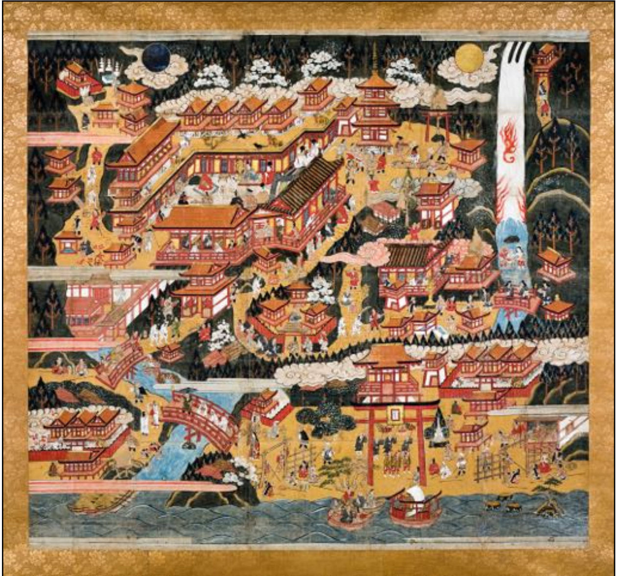
Figure 2. Nachi sankei mandara , hanging scroll, sixteenth to seventeenth century. Ink and colors on paper, 259 x 165 cm.

Sankei mandara are described by scholars as annaizu 案内図 (guide maps) to sacred grounds and their environs. 2 The term annaizu implies a certain degree of accuracy and objectivity when presenting the landscape—the viewer expects to be able to use the image as a map to navigate through the illustrated area. I will argue that while each sankei mandara do provide fairly detailed and usable descriptions of the layout of the shrine-temple complex and the roads leading to it, they are also calibrated, selective, and subjective accounts of the represented