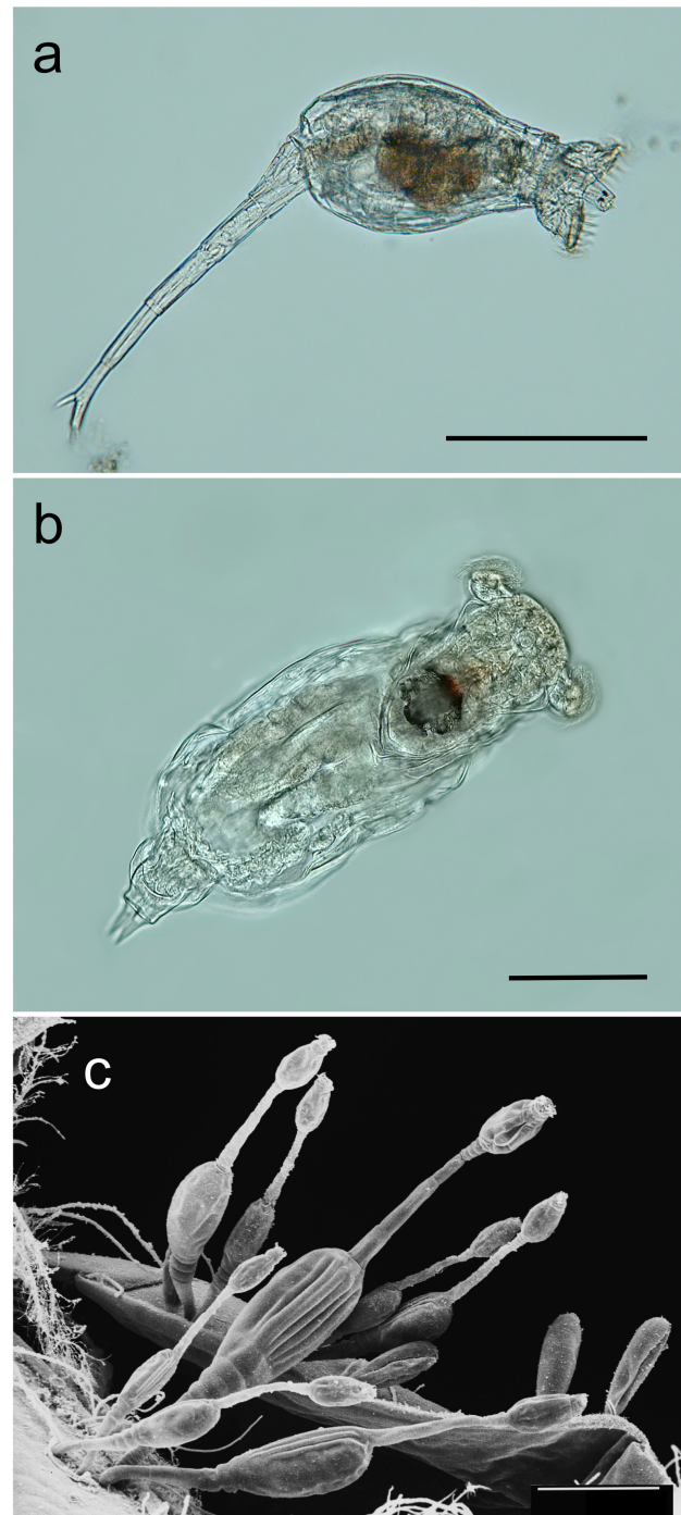
Figure 1. Images of representative rotifers: a) the bdelloid Rotaria macrura (Ehrenberg, 1832), b) the monogonont Notommata aurita (Müller, 1786), the seisonacean Seison nebaliae Grube, 1859. Scale bar = 0.1 mm (a, b), 0.2 mm (c).

A simplified version of the checklist is given in Supplementary File S1.