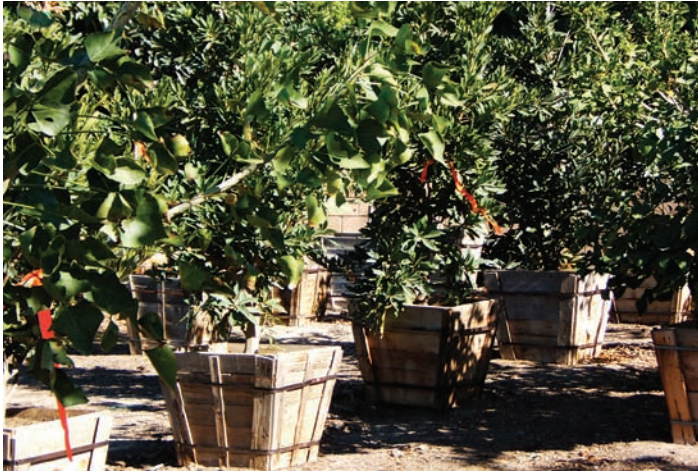
Infested citrus plants in a San Diego County nursery are marked with red flagging tape.