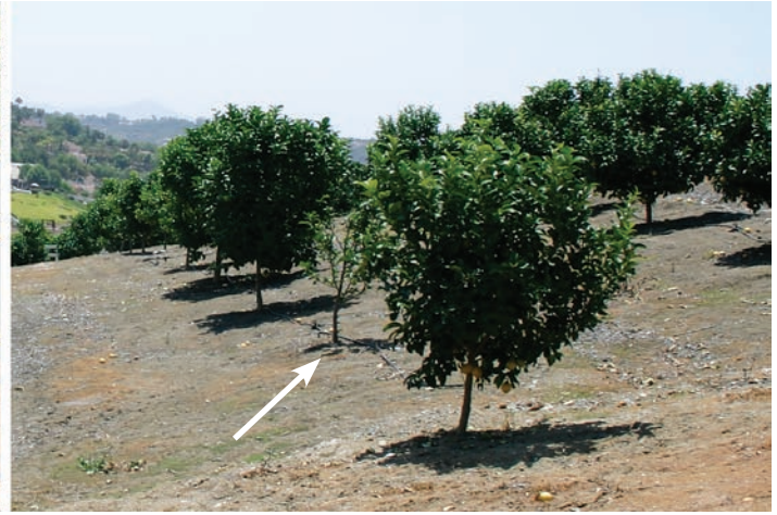
The small, defoliated tree shown in a San Diego County lemon grove has numerous weevils infesting the roots.

we developed alternative Diaprepes pest-control treatments based on methods used by Florida growers. These treatments were then modified for California's agricultural and climatic conditions. Once the alternatives were determined, costs were estimated by contacting pest-control companies. For alternatives that can be custom applied, we obtained the total cost for materials and applications. For alternatives that are not custom applied, pest control companies provided material costs. The application costs to complete these pest treatment alternatives were taken from the Sample Costs of Production studies by UC Cooperative Extension ( http://coststudies.ucdavis.edu/current.php ). After treatment costs per acre were estimated, costs were compared to determine the options that California growers would most likely adopt, and an average value over the most likely treatments was calculated. Then the treatment costs per ton for citrus and avocado were estimated by dividing costs per acre by average tons produced per acre.