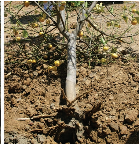
Left , root weevil larvae create “feeding galleries” on lemon tree roots; middle , damaged roots can provide entryways for root-rot organisms; right , a lemon tree infested by Diaprepes was defoliated and had a very small root system.