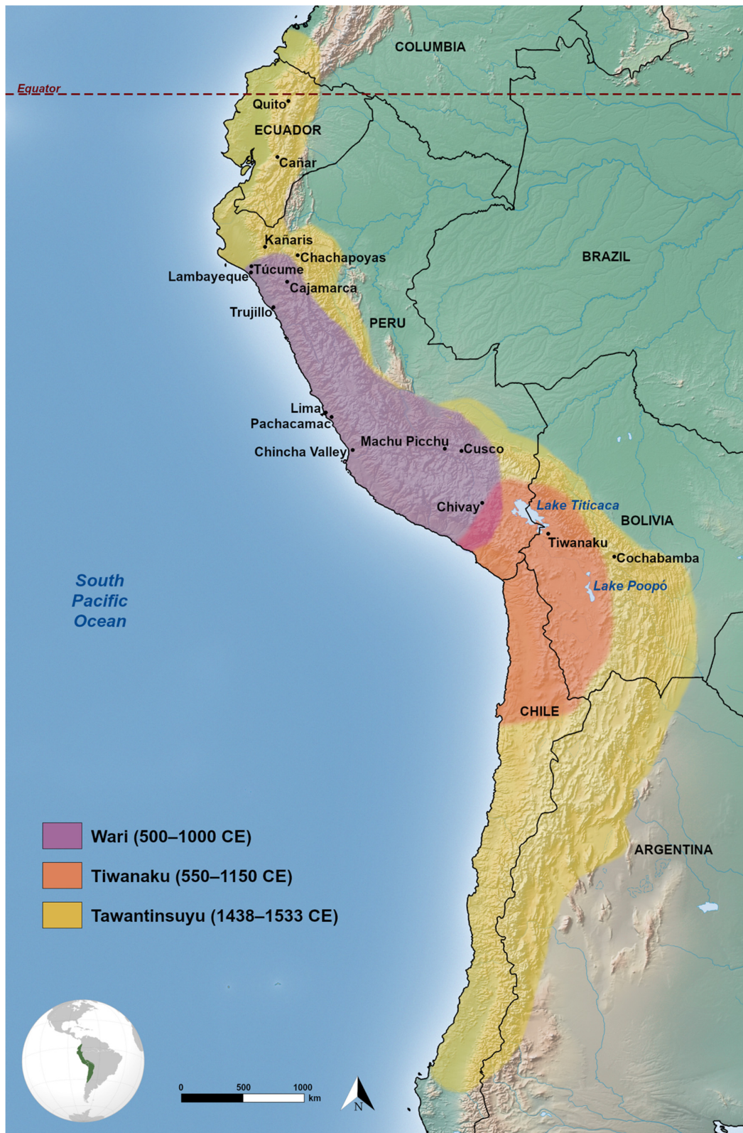
Figure 1. Political regions in the Andes. The Tiwanaku sphere (orange) and Wari sphere (purple) are overlaid with the maximal range of Tawantinsuyu (yellow). Locations mentioned in the text are also shown. Globe inset shows the location of Tawantinsuyu in the American continents. Made with Natural Earth.

engineering skills are evidenced by a 40,000-km network of roads ( Qhapaq Ñan ) [5] and megalithic architectural sites such as Machu Picchu, built to withstand earthquakes [6].