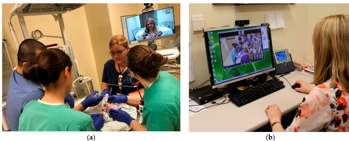
Figure 2. Telesimulation at University of California, Davis Children’s Hospital. (a) Remote participants resuscitating a neonatal patient simulator; (b) Instructor viewing the resuscitation over a telemedicine connection.